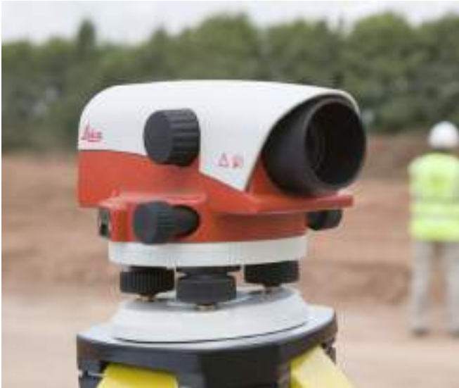
Optical level / dumpy level