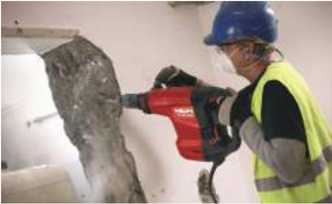
Hitli TE800 heavy breaker