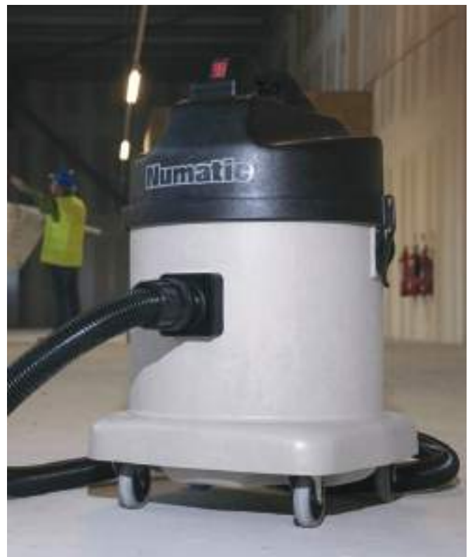
Numatic Class M advanced filtration vacuum cleaner, 110V