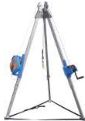
Fall arrest tripod c/w recovery winch