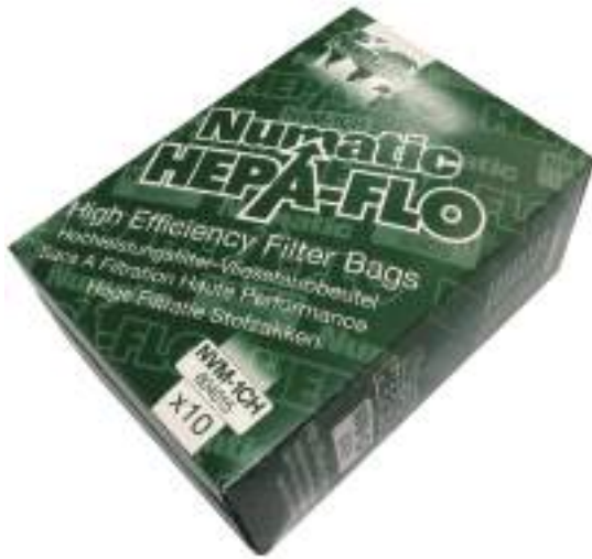
Numatic Hepaflo Dust Bags, pack of 10 – various sizes