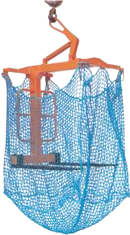
Self levelling crane forks