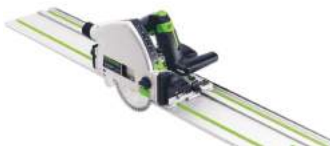
Plunge saw festool TS55 c/w rails and accessories