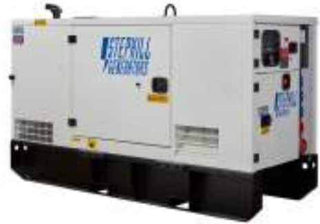
Static diesel generators 20 - 500 kVA