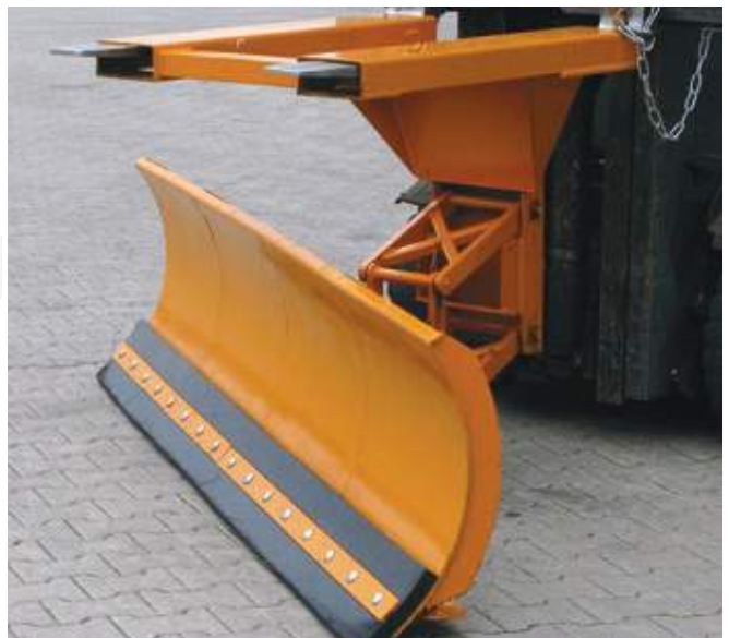
1.8m snow plow blade attachment