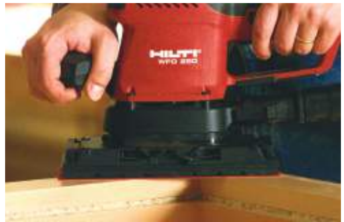
Finishing sander, rectangular, 110V