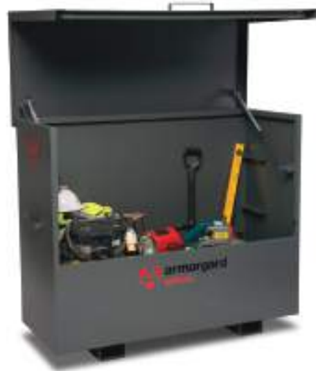
Large site chest - approx. 1.2m x 1.2m x 0.6m

CONTAINERS CAN BE SUPPLIED WITH A VARIETY OF RACKING AND SHELVING SYSTEMS, AS WELL AS PURPOSE MADE LOCK BOX PADLOCKS