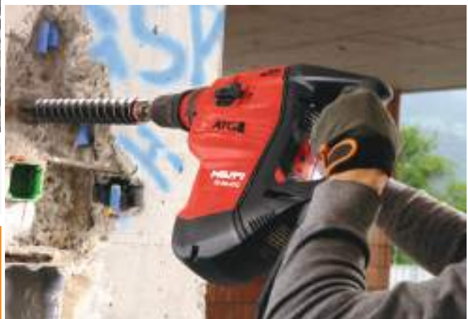
Heavy weight combi hammers 9 / 12 kg Hilti TE80 or similar, 110V