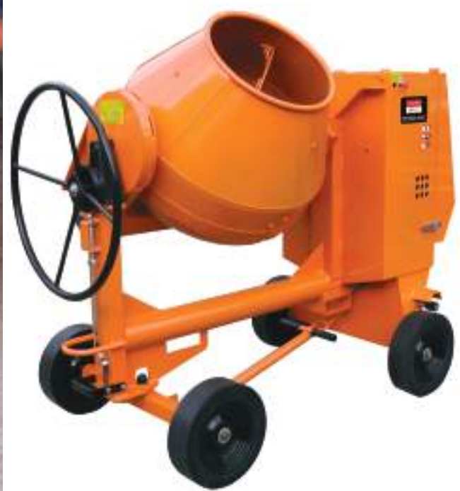
Various sizes of site mixer, 100XT, 150X or 175XT or equivalent, diesel or 110V electric powered