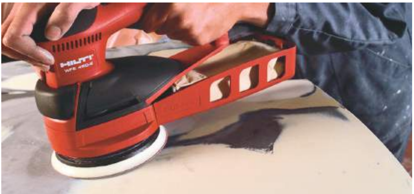
Random orbital sander, circular, 110V