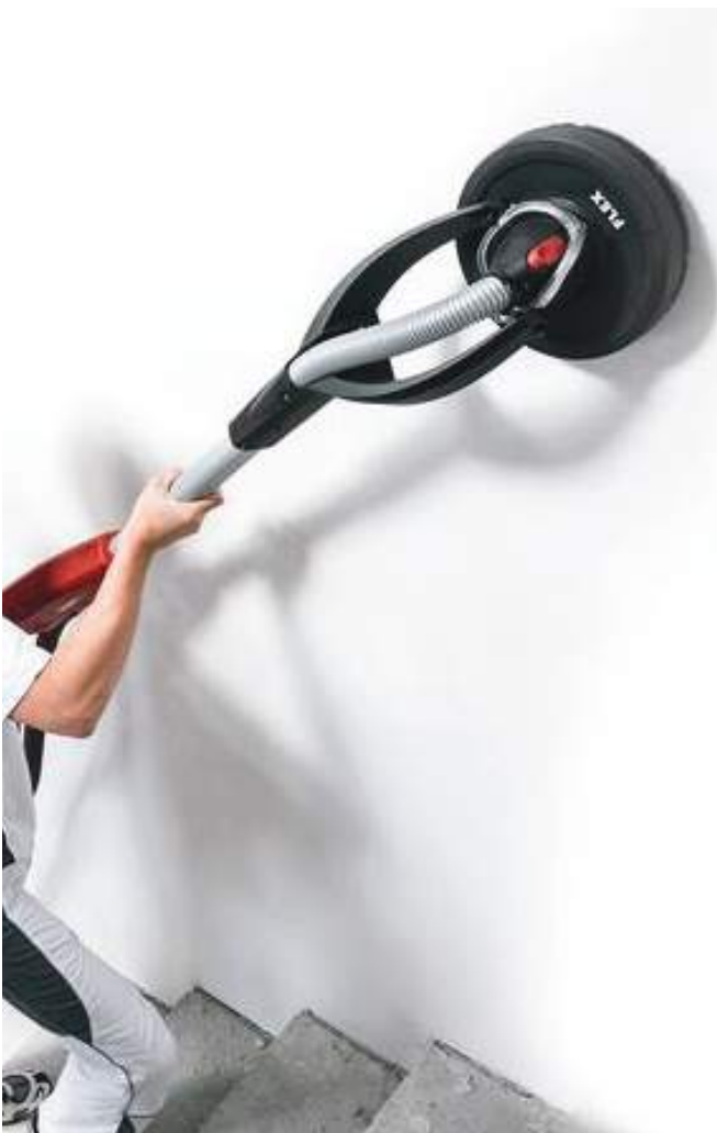
Dry wall / giraffe sander