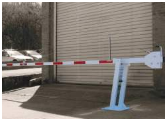
Vehicle access control barrier, manual lift arm. 5m to 7m long

FENCING & BARRIER ERECTION SERVICE AVAILABLE. CONTACT US FOR A QUOTATION