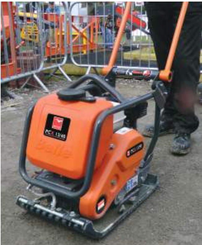
Medium duty petrol one way plate - 100kg - 400mm