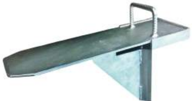
Strongboy / Brickshore prop heads

Trench struts No. 0; 0.30 - 0.47m Trench struts No. 1; 0.47 - 0.69m Trench struts No. 2; 0.69 - 1.09m Trench struts No. 3; 1.09 - 1.68m