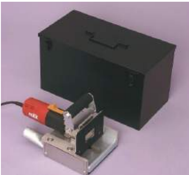
Door trimming saw, 110V