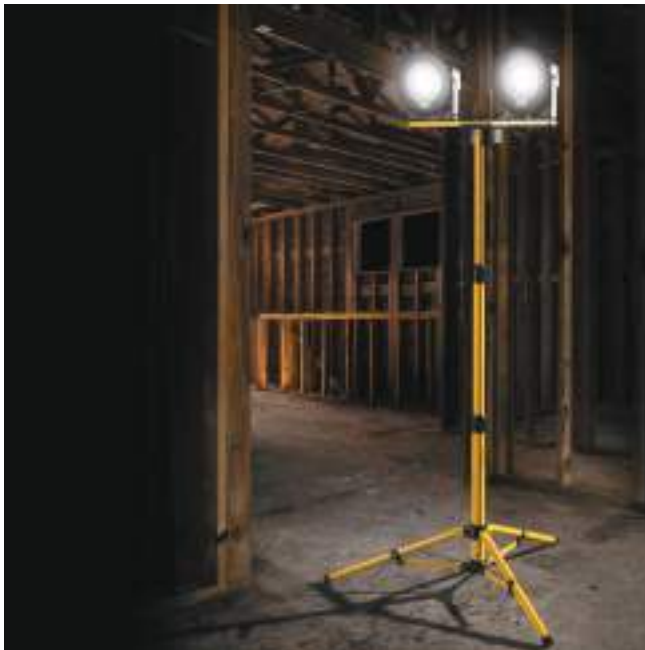
Twin head LED worklight