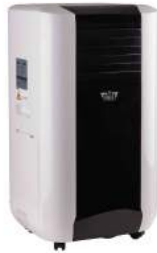
AC1400 Elite 14600 BTU