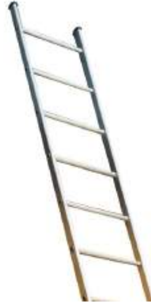
Class 1 Industrial double extension ladders approx. Closed and open lengths shown.