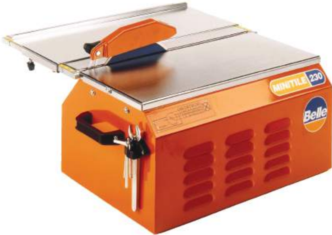
Diamond blade table top tile saw