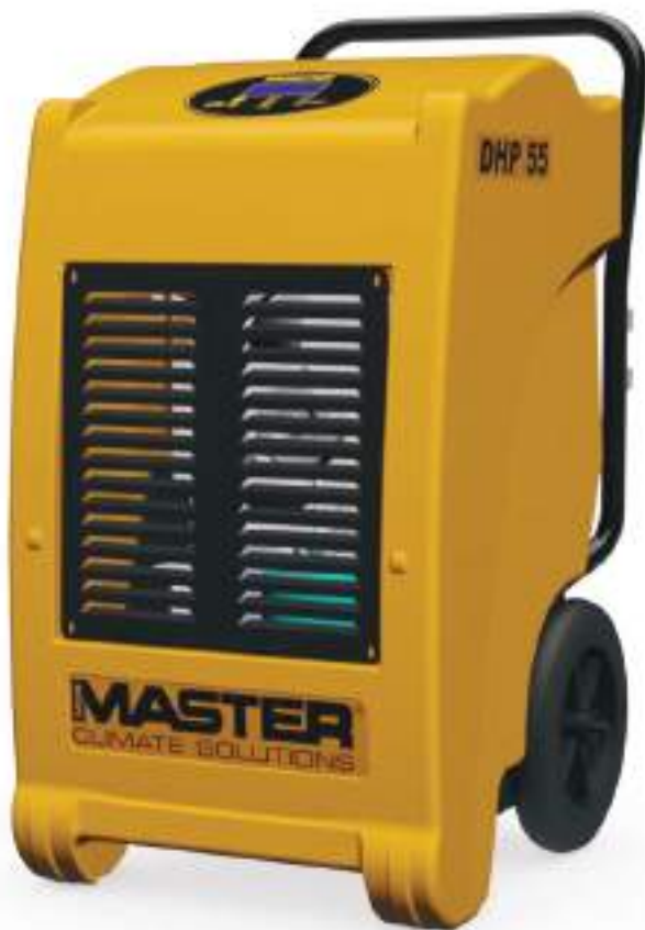
Dehumidifier (large/ dual voltage)