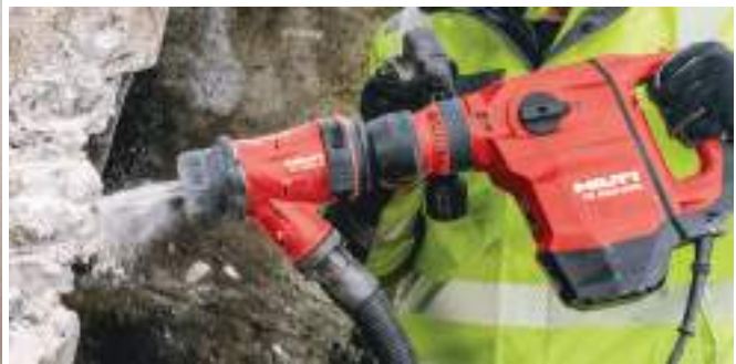
Hilti TE500 medium breaker