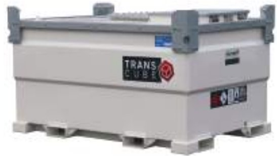
Fuel bowsers for generators Distribution box for generators