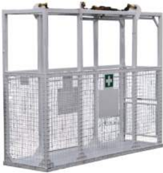
Crane lift stretcher cage