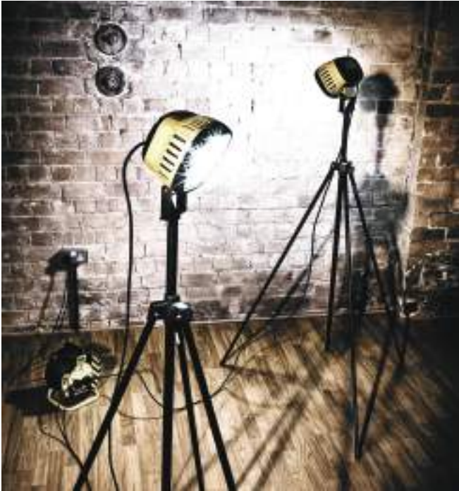
LED 3000 2.6m mast lights, 110V, single or double head