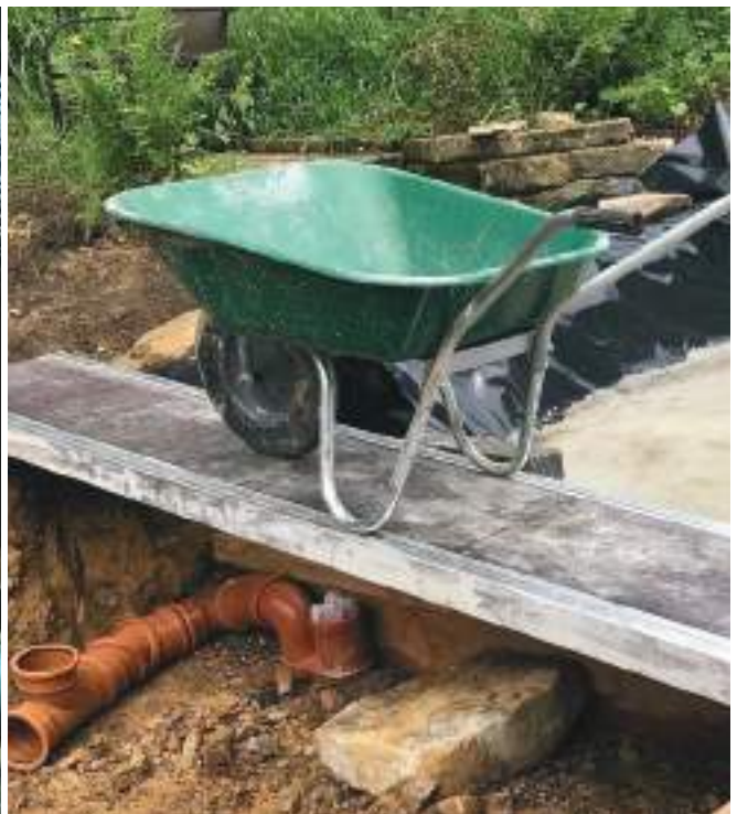
450mm Wide Staging Boards or 600mm Wide Super Board Staging Boards. 2.4m to 7.3m lengths, either single or double sided handrail available