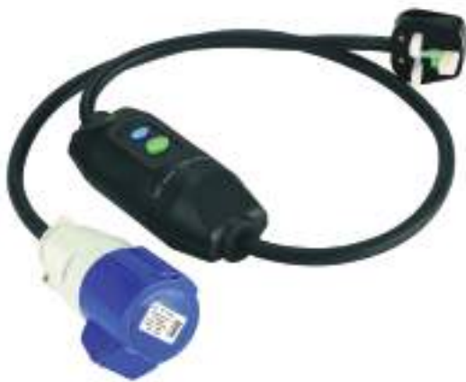
230V Inline RCD unit - 16A to 13A etc