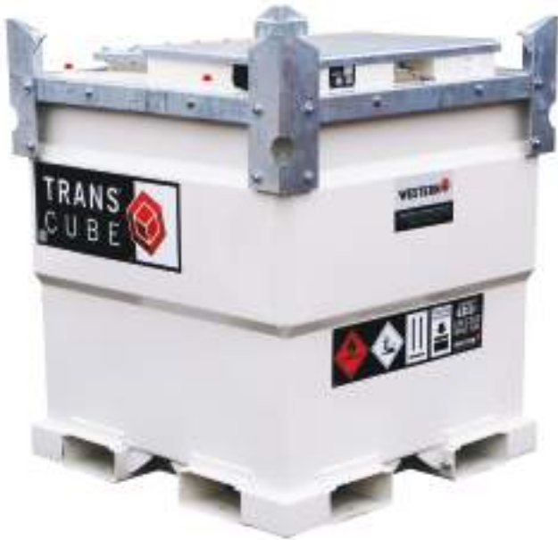
Bunded, static fuel bowser, 1000, 1500 and 200 litre sizes, available with manual pump, or 12V pump. All with dispensing hose trigger