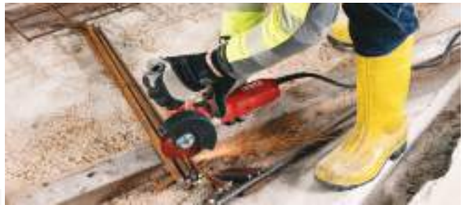
5" angle grinder, 110V Cordless 4.5" grinder