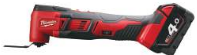
Multitool, 110V or cordless