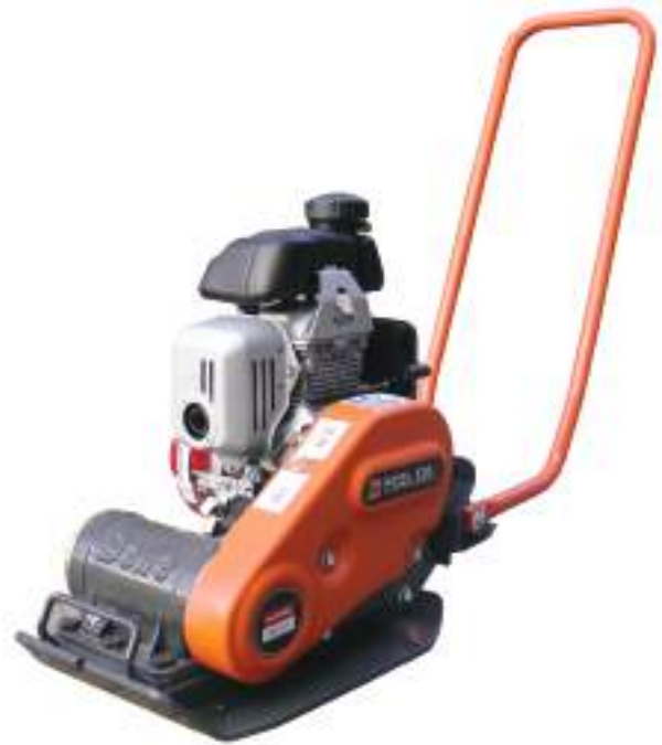
Light duty one way petrol plate - 50kg, 300mm, 350mm