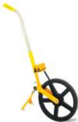
Trumeter measuring wheel