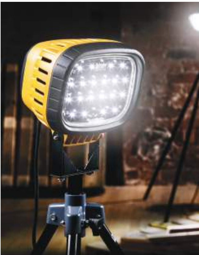
LED 6000 2.6m single head mast light, 110V