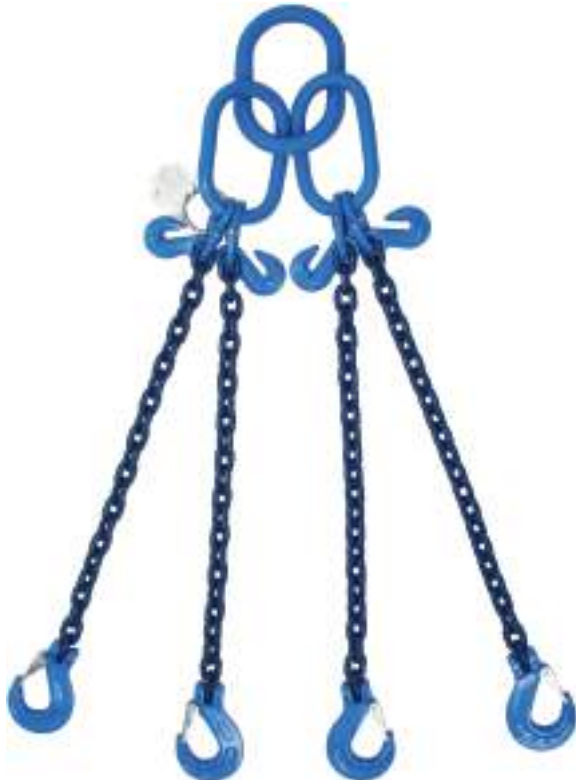
Four Leg Chain Slings