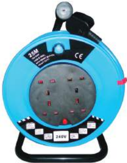
230V 50m 13amp extension reels