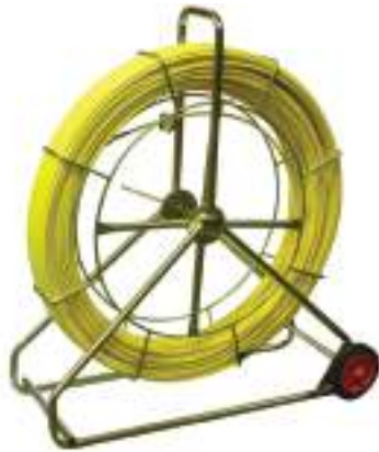
120m x 9mm Cobra flexible fibreglass rod on a reel