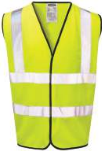
Hi viz vest