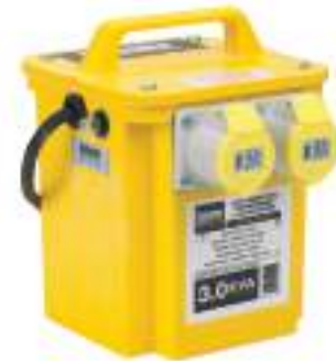
3 - 5 kVA portable transformer