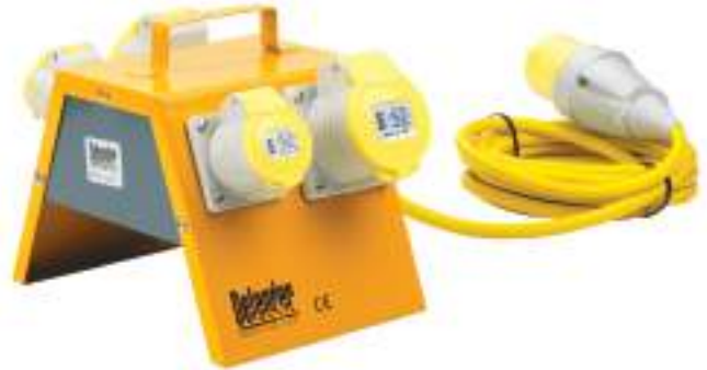
16 amp 4 way splitter boxes (240V or 110V)