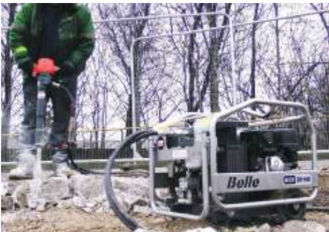
Hydraulic Power pack and breaker c/w hoses and tool tray

ACCESSORIES FOR HIRE - POINTS, CHISELS & BOLSTERS. ONE OFF CHARGE, REFORGING FOR POINTS AND CHISELS