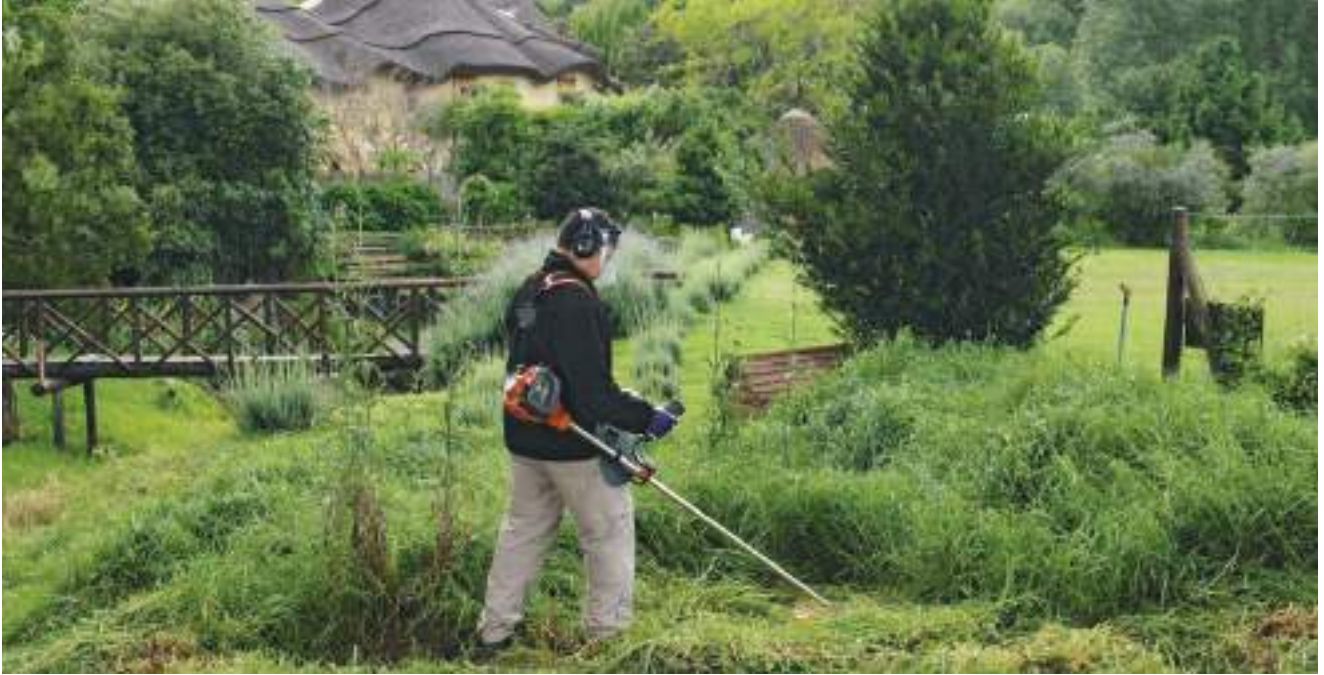
2 stroke petrol strimmer / brush cutter