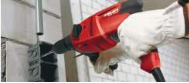
1/2" 3 jaw chuck lightweight drill