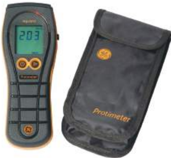
Protimeter Aquant non invasive