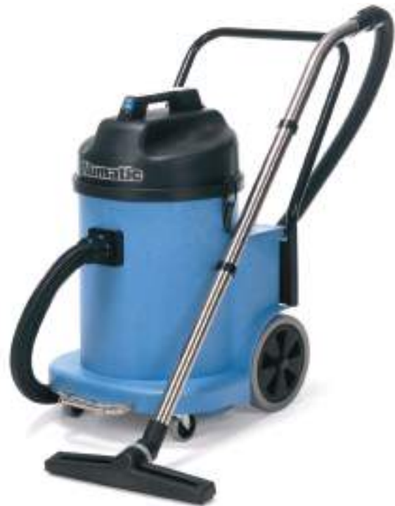
Wet & dry vacuum cleaner - twin motor, 110V