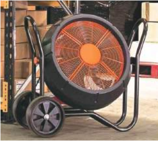
18000 m 3 per hour air raid fans, 110V