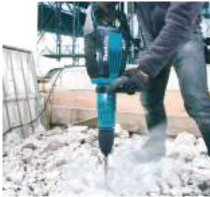
Makita HM1214C or similar heavy breaker