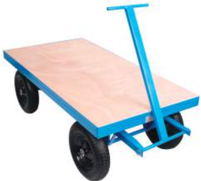
Flatbed turntable truck, pneumatic or solid rubber tyres