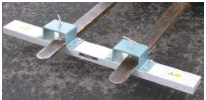
Forklift 1.8m bar magnet attachment