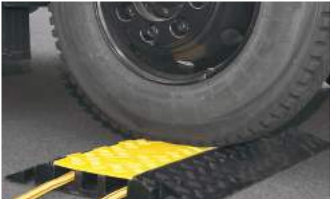
Cable / hose protection ramps with lift up lid, 1m x 500mm wide