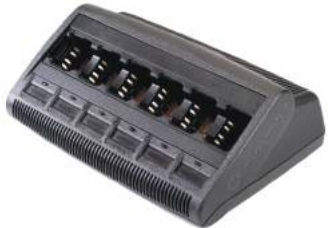
6 way charger to suit, 240V Extra single charger, 240V Two way radios - Non licensed