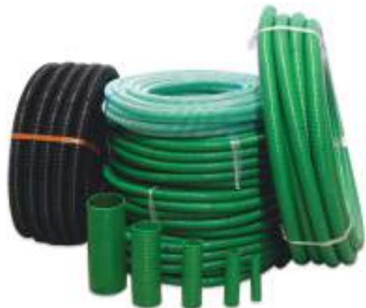
6m green rigid pump hose extension with conector, 25mm, 50mm or 75mm