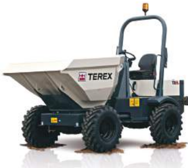
1 tonne - 9 tonne dumpers