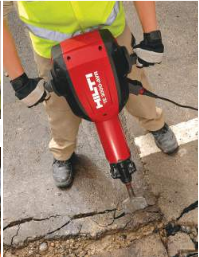
Hilti TE3000 110V road breaker (TE2000 available)