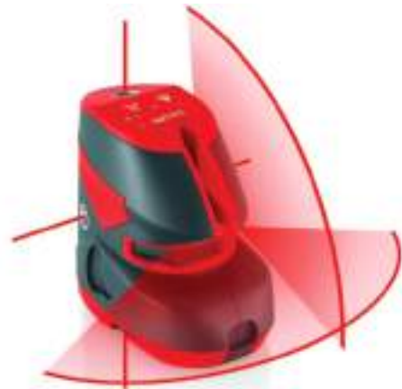
5 beam laser pointer - Leica Lino L2P5 or similar