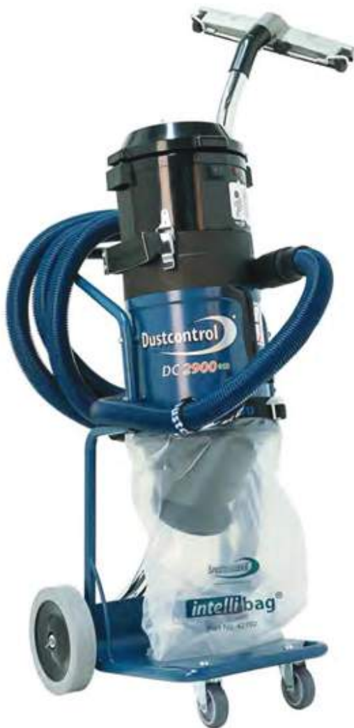
Collection Bag for Dust Extractors