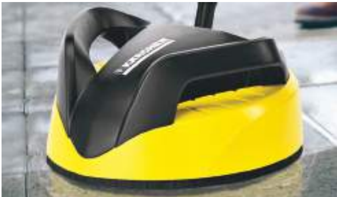
Pressure washer flat surface / paving cleaner