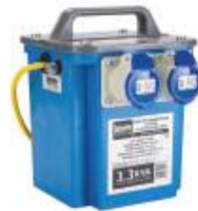
3 kVA portable step up transformer