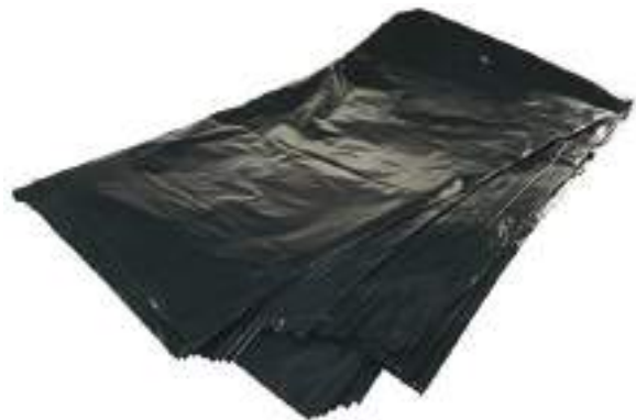
Black refuse sacks pack of 75