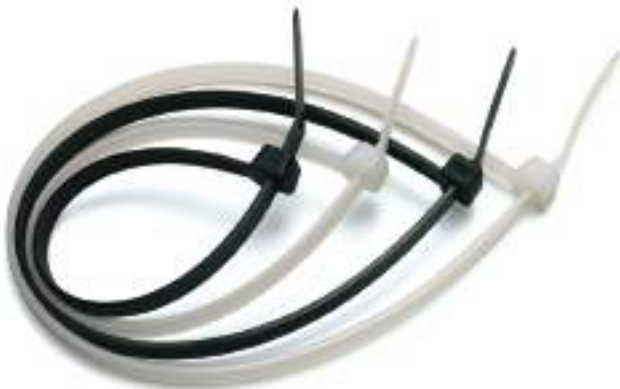
Cable ties - various sizes available

We can supply a variety of gloves to suit all your requirements. Please call us to discuss your needs