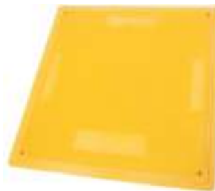
GRP trench cover