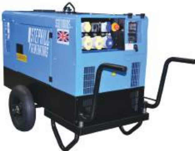
10 kVA mobile super silenced diesel generator