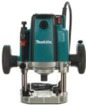
Plunge router, 110V