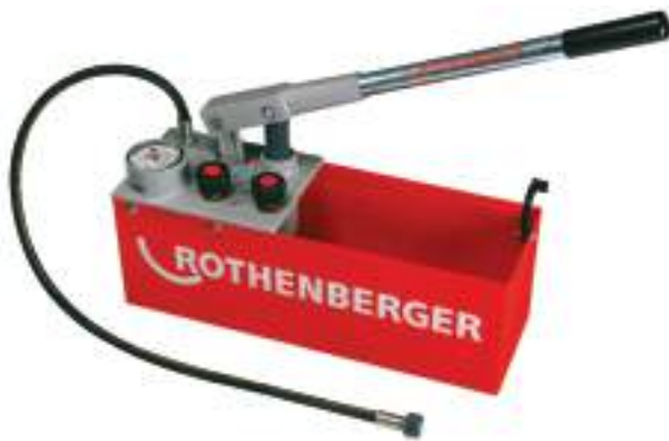
Pipe pressure testing pump - manual