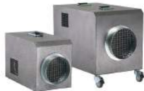
18kW Industrial fan heaters. 3 phase 415V