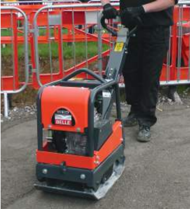
Heavy duty diesel forward / reverse plate - 200kg + - 500mm