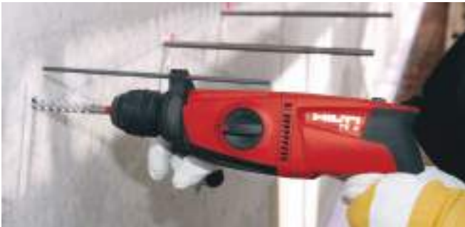
2kg rotary hammer drill, SDS+ Hilti TE2 or similar