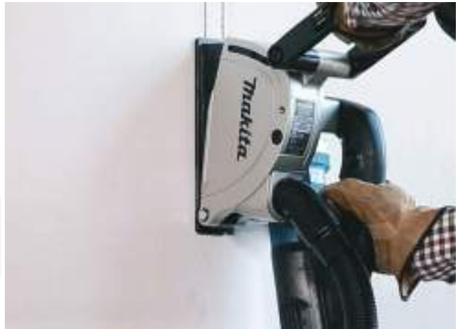
Wall chaser, 110V