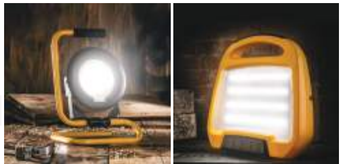
LED floor light