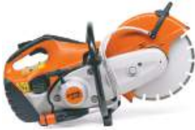
Petrol 12" disc cutter (2 stroke oil required) Masonry water bottle