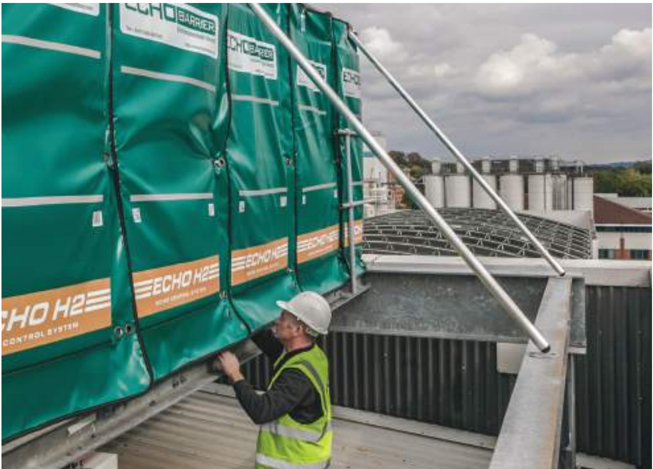
Echo barriers / noise control barriers