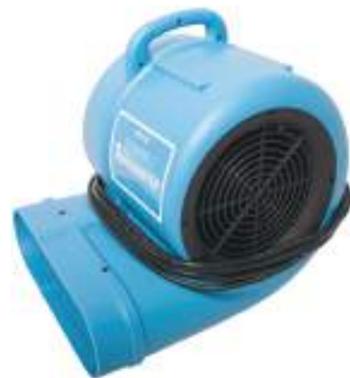
Carpet dryer / air mover