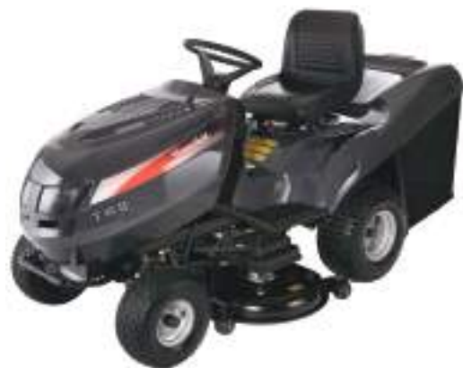
Ride On Mower