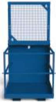
Forklift access cage