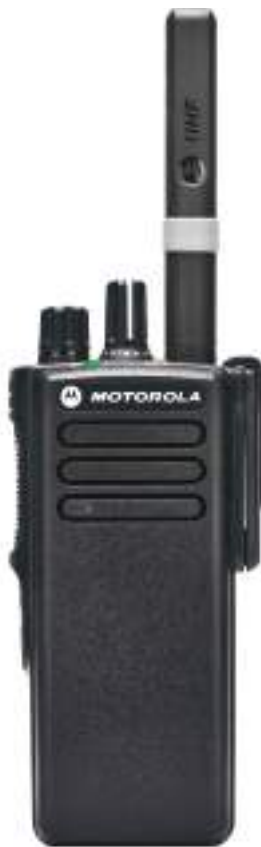
Digital two way radios - licensed