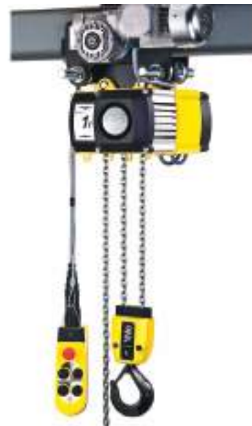
Electric chain blocks, various heights and safe working loads