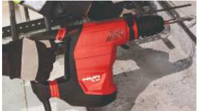
Light weight combi hammers 5kg Hilti TE30 or similar, 110V