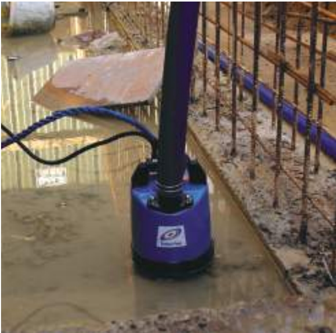
Submersible pump - 13500 litre / hour, 110V Available with or without a float switch