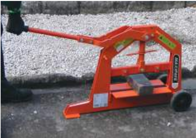
Small paving block cutter