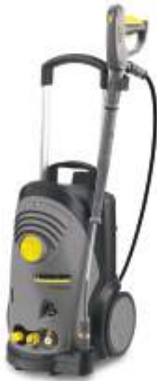
Cold water pressure washer, 110V Light duty Petrol also available