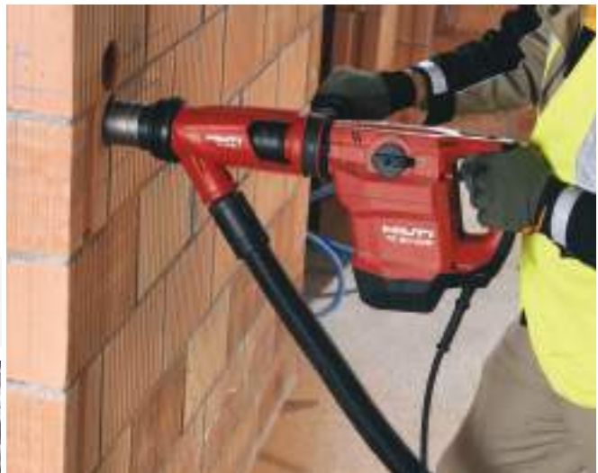
Medium weight combi hammers, 7kg Hilti TE50 or similar, 110V