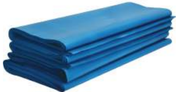
Rubble bags pack of 10