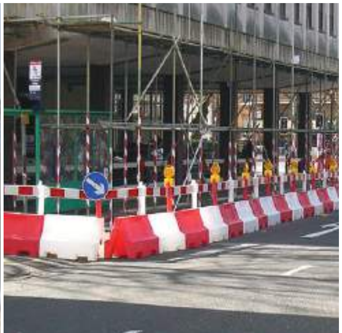
Red & White Traffic Barriers Water Fillable