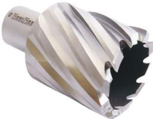
Cutting Broaches 12mm to 50mm mag drill