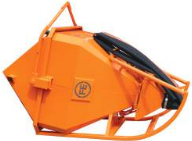
Concrete Skips and Column Skips