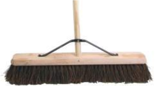
Hard broom wide or narrow