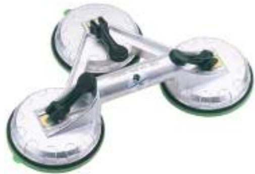
Double or triple glass suckers