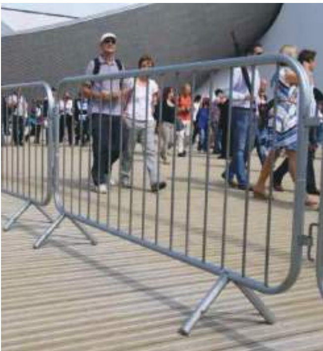
Pedestrian barrier 2.3m c/w fixed leg