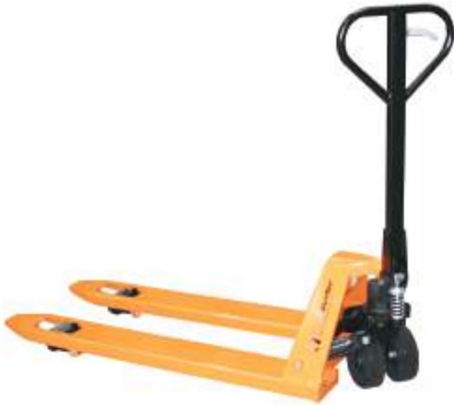
Standard pallet truck Wide pallet truck 1.5 - 2m long pallet truck