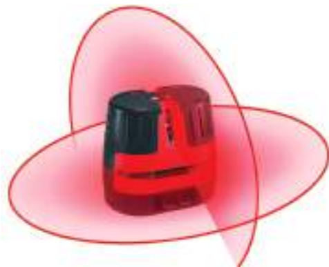
360° laser pointer - Leica Lino L360 or similar