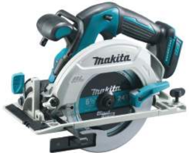
7" circular saw, 110V or cordless