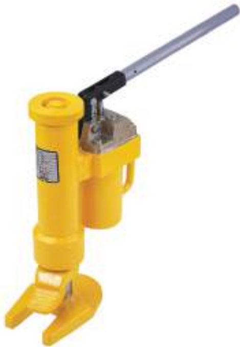
360 degree 5 tonne toe jack (suitable for cabin and machine lifting)