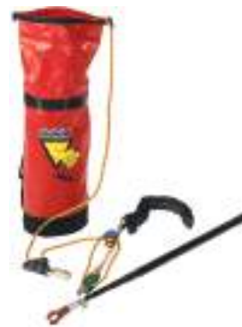
Tower crane rescue kit