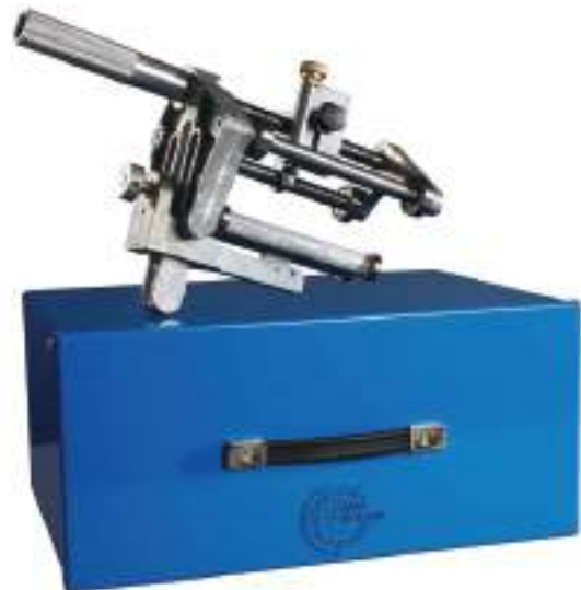
Pipe scraping tools