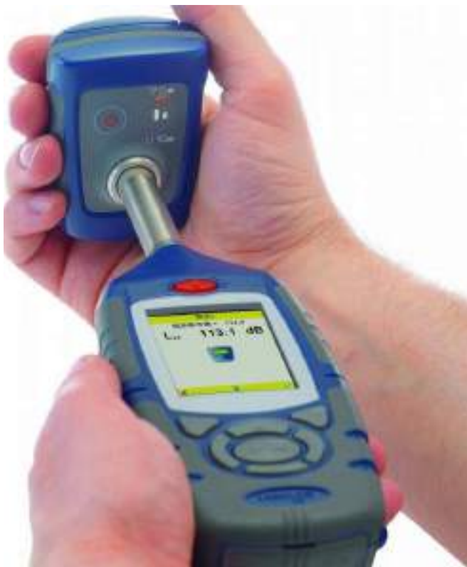
Casella CEL -0246 sound meter c/w calibration kit