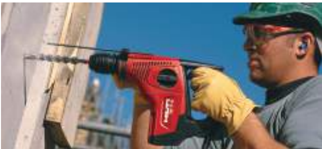
4kg rotary hammer drill, SDS+ Hilti TE7 or similar