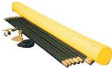
Drain rod set Recordable drain inspection Camera