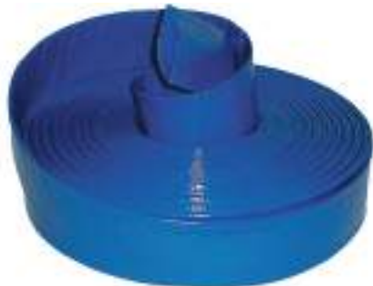
6m lay flat hose extension, with connector, 25mm, 50mm or 75mm