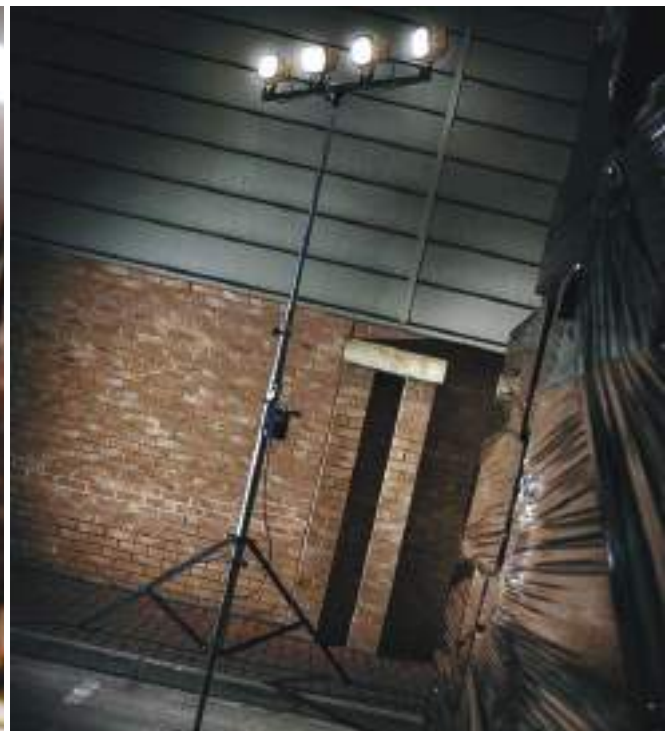
LED 6000 5m Four head mast light, 110V, also available with 5m mast

Other lighting products available on request