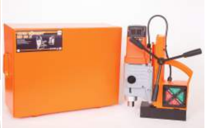
Piccolo Magnetic drill, up to 32mm