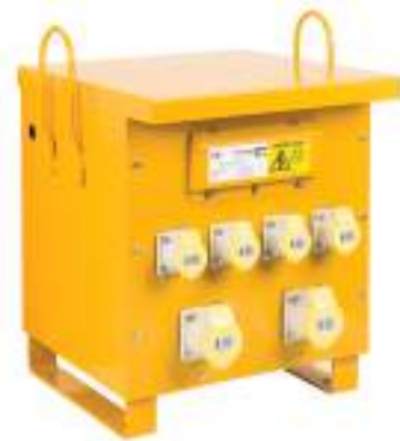
Single or 3 phase site transformer