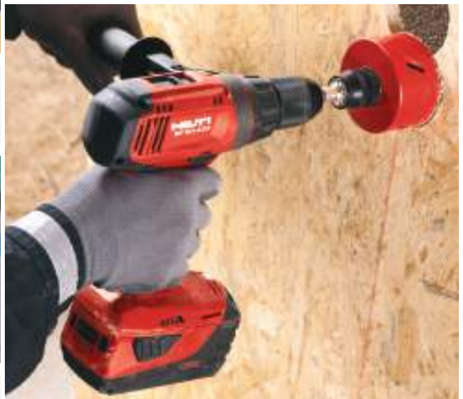
18V cordless combi drill / driver