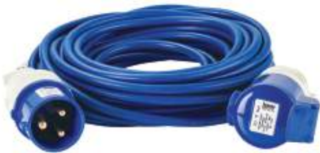
240V 14m 16 amp extension leads