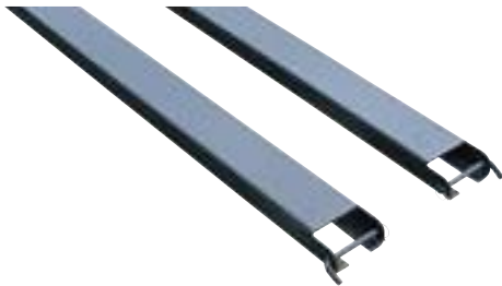
Forklift fork extensions