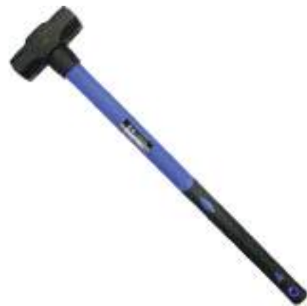
HD sledge hammer