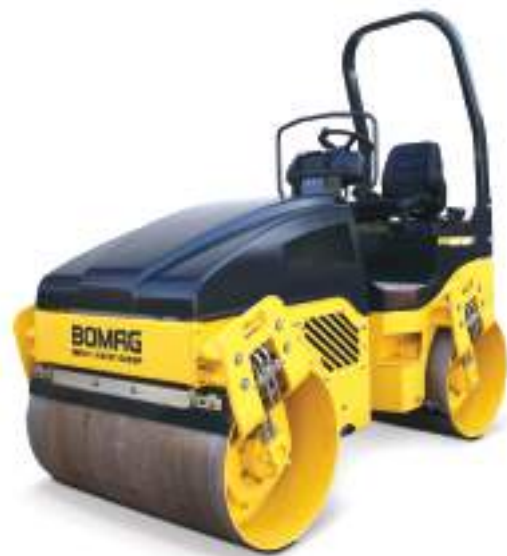
0.8 tonne - 3 tonne vibrating rollers