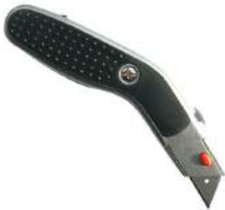
Stanley cutting knife blades