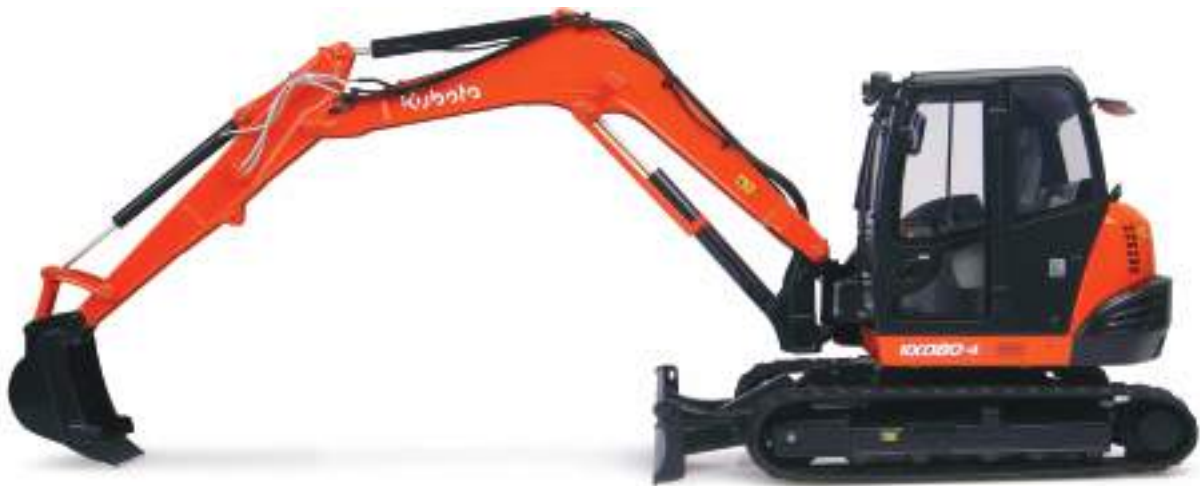
0.8 tonne - 13 tonne excavators