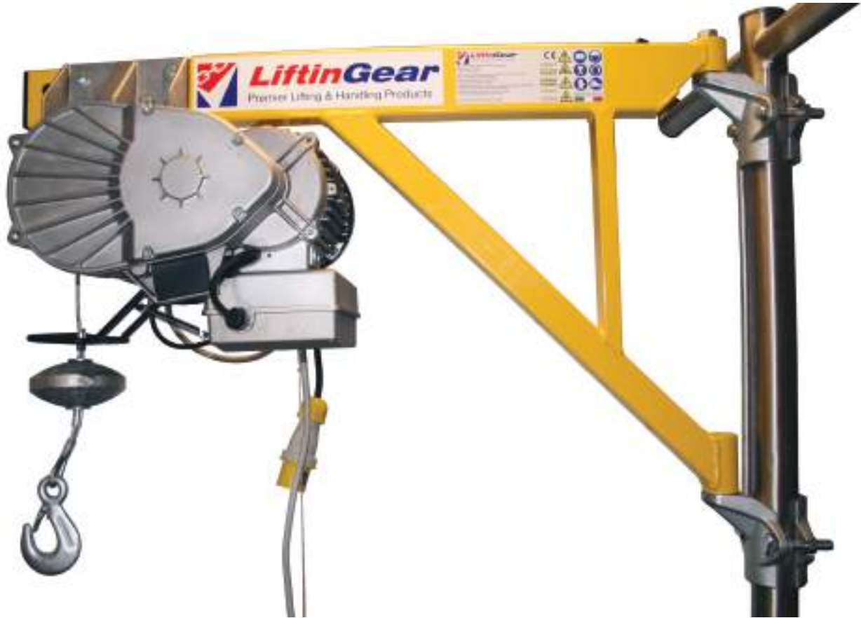
200kg S.W.L. 180° hoist