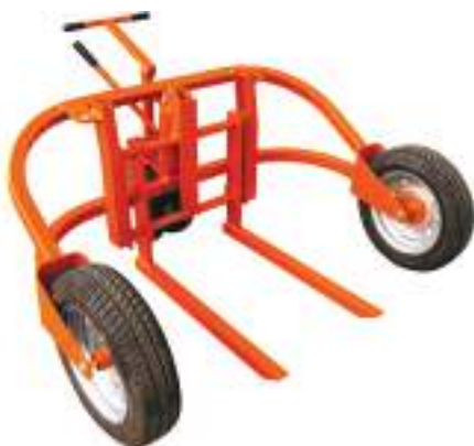
All terrain pallet truck

WE CAN SUPPLY MORE THAN SHOWN HERE, PLEASE CONTACT US FOR MORE DETAILS