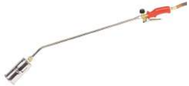
Single head blow torch and lance