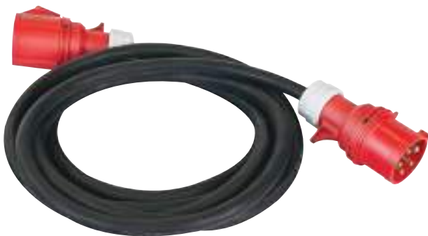
415V 25m 6mm 2 32 amp 5 core armoured extension cables