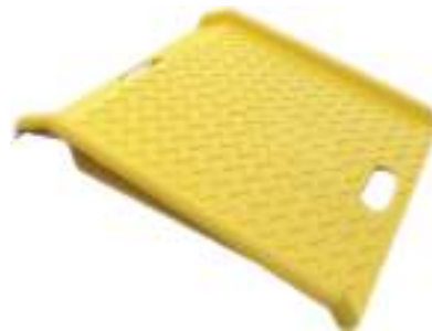
Kerb ramp / kerb hopper