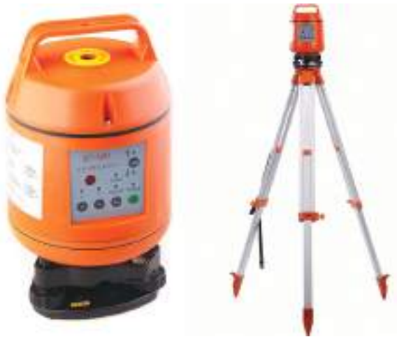
Single beam self levelling plumb laser