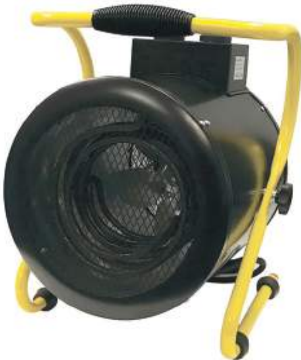
Retail fan heater