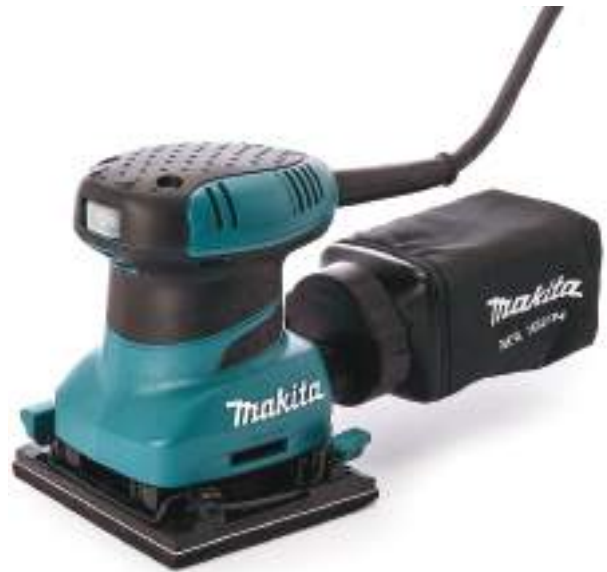
Palm Sander, square, 110V