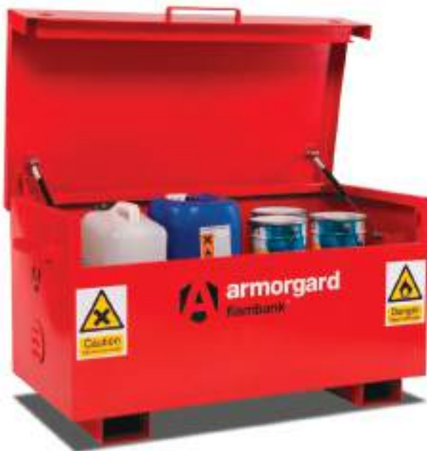
Chemical or flammable material site box - approx. 1.2m x 0.6m x 0.6m