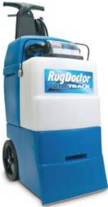
Rug doctor Industrial wide track carpet cleaner - 240V only. Supplied with upholstery cleaning attachments