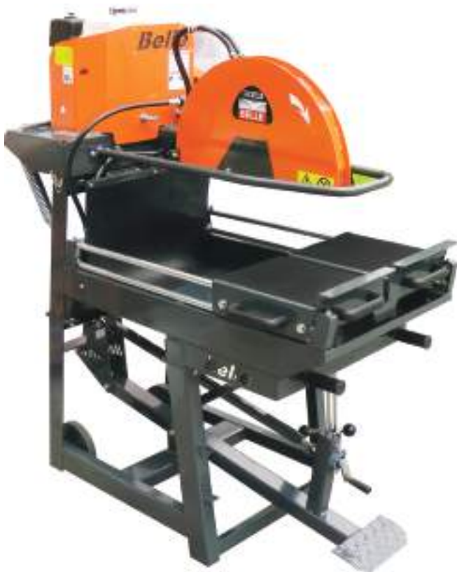
500mm masonry table saw, petrol or 110V