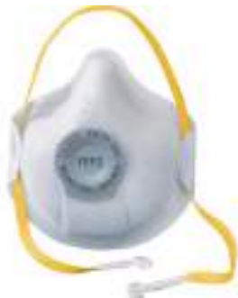
Disposable dust masks