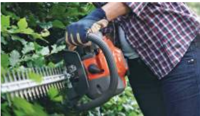
2 stroke petrol hedge trimmer