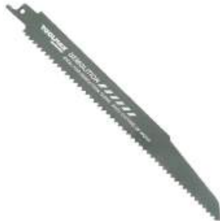
150mm recip saw blade wood cutting