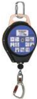
Fall Arrest Block