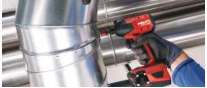
18V cordless impact driver