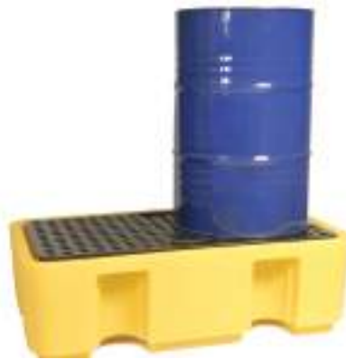
2 and 4 Drum bund / spill tray