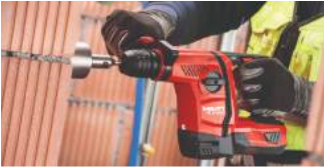
24V Heavy duty hammer drill (with extra battery)