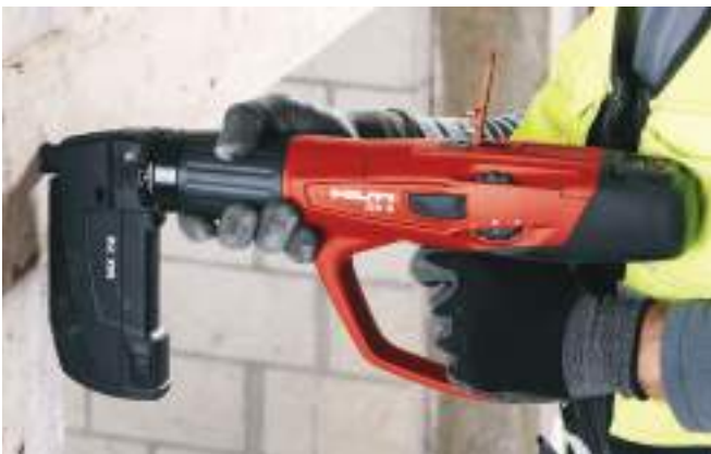
Powder actuated direct fastening tool, Hilti DX5 or similar DX5 extension arm Cartridges and nails as required