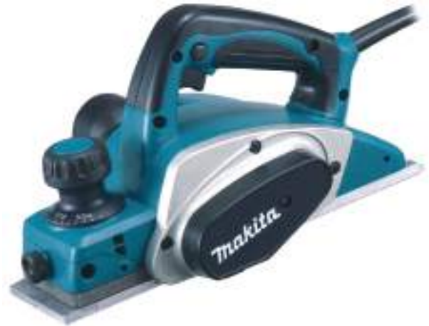
Power planer, 110V