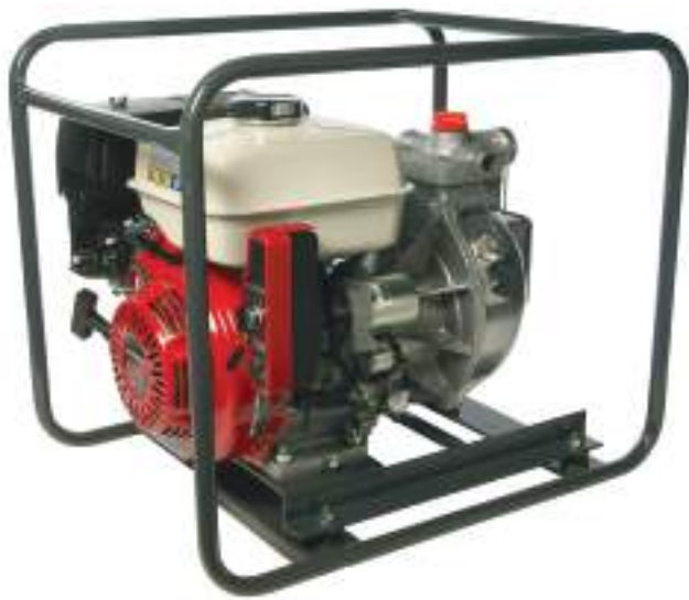
Centrifugal clear water pump - petrol powered. 50mm or 75mm