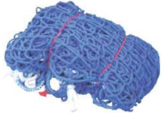
Safety net for crane forks and block grab