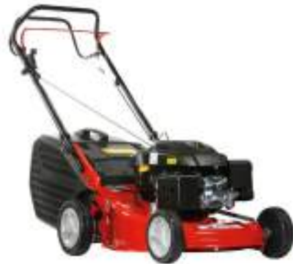
Rotary mower, petrol or 240V