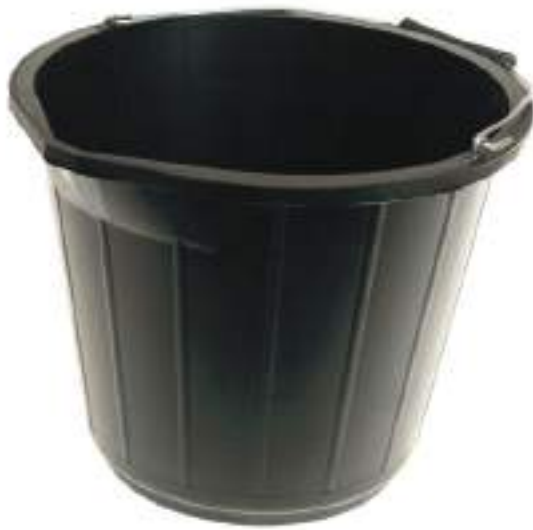
14L plastic mortar mix bucket