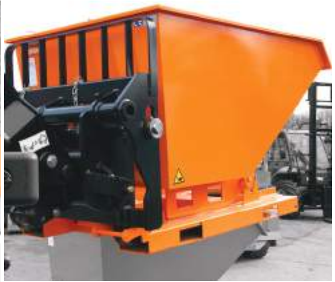
1200 litre roll forward skip 1200 litre safelock telehandler skip