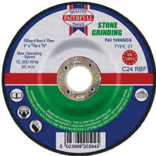
Stone Grinding Disc 115mm -350mm