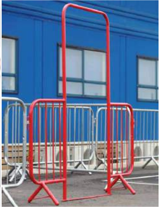
Walk through Pedestrian barrier 2.3m for road crossing, red with fixed legs