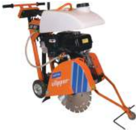
Petrol floor saw