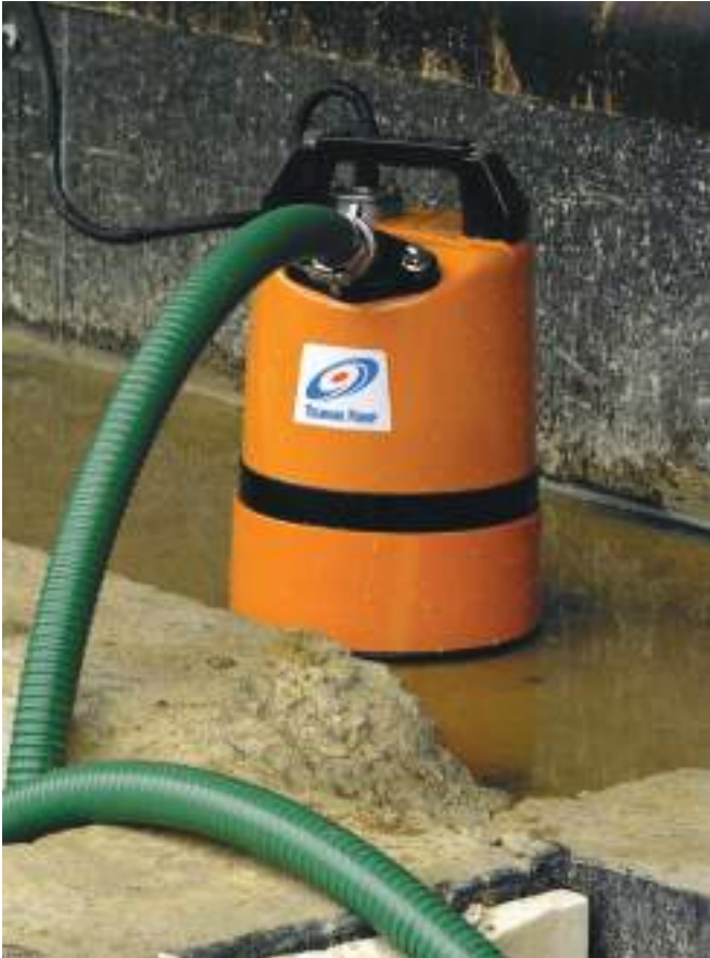
Puddle sucker / sweeper pump 10200 litre / hour, 110V