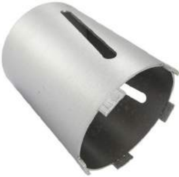
Premium Diamond Core Bit 38mm to 127mm