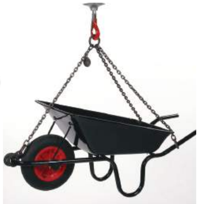
Wheelbarrow lifting chains