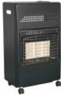
Gas cabinet heaters