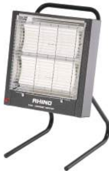
Ceramic radiant heaters, 110V