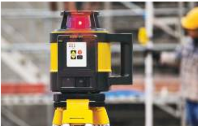
Rotating laser level - Leica Rugby 820