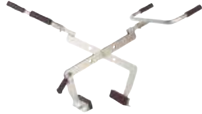
Kerb lifting / universal lifting handles