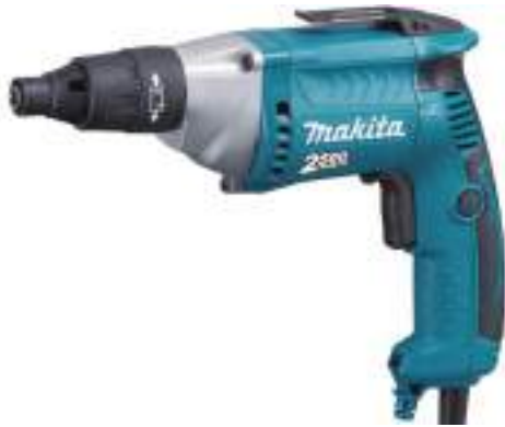
Tek screw gun / 110V