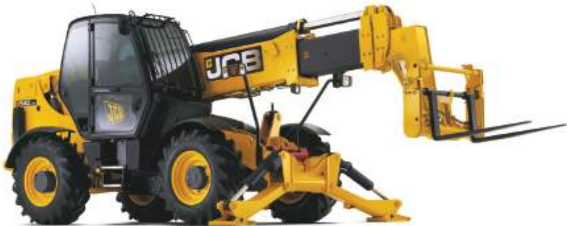
5m - 17m telehandlers