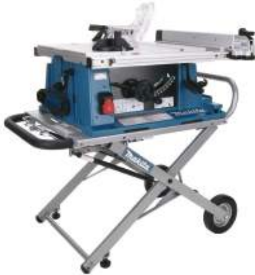
Table saw adjustable stand