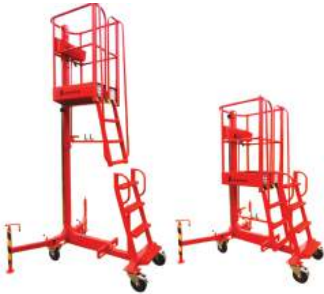
Quickstep 200 automatic work platform