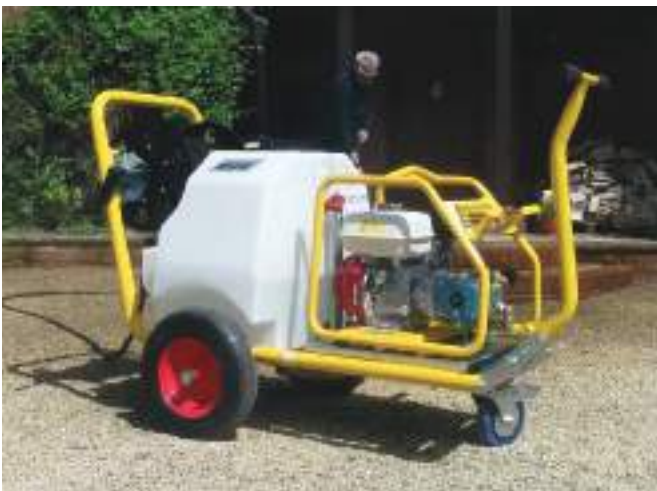
Diesel mini bowser washer