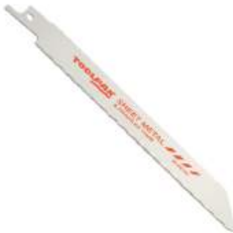
150mm recip blade wood & metal cutting