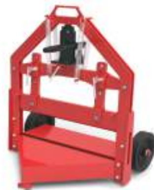
610mm hydraulic block splitter