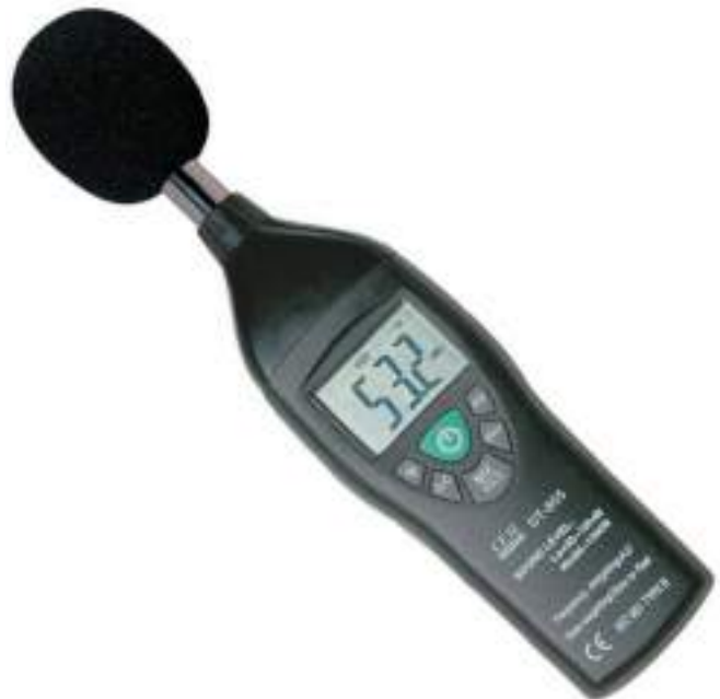
Digital sound meter