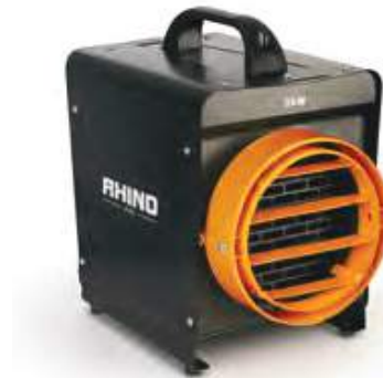
3kW fan heaters, 110V