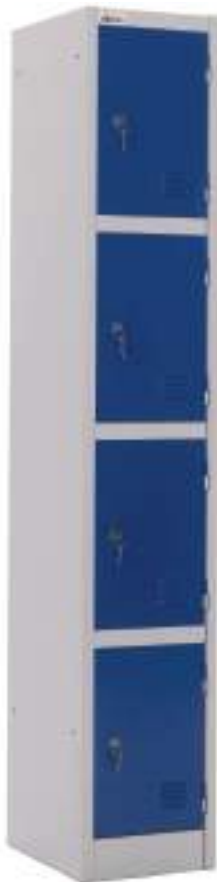
4 bank solid lockers