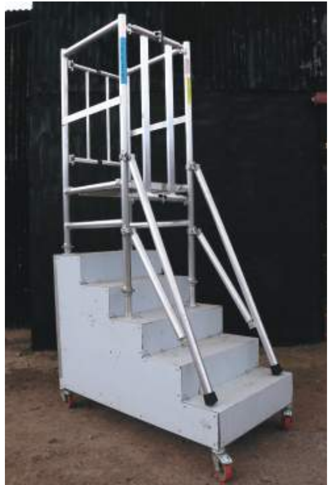
Stairpod portable alloy tower 0.5m platform height