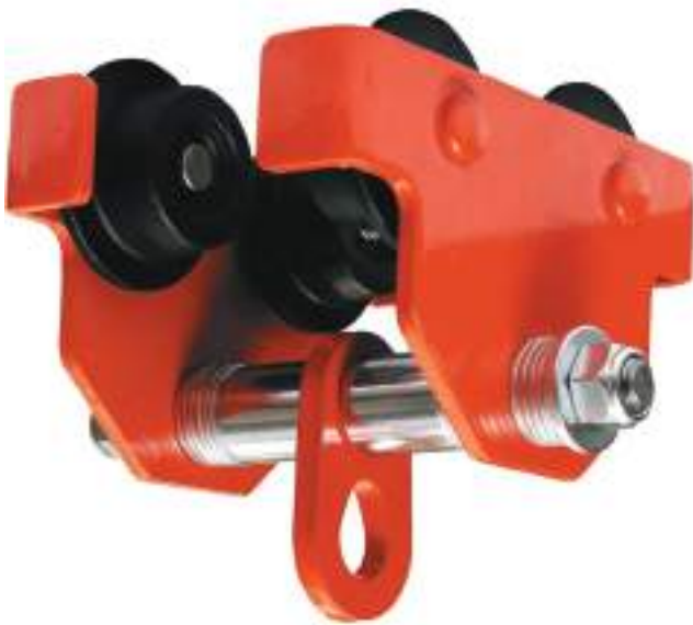
Beam Trolleys - various safe working loads