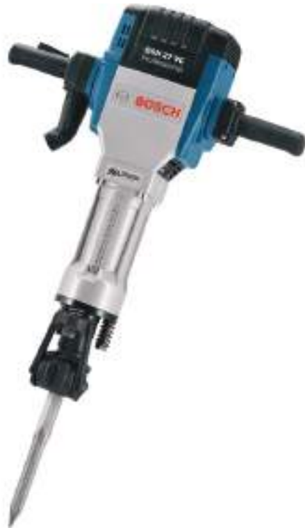
Road breaker 30kg, Bosch GSH27 or similar, 110V