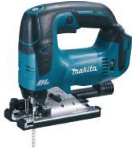
Jigsaw, 110V or cordless