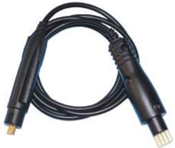
Protimeter Hygrostick and extension lead