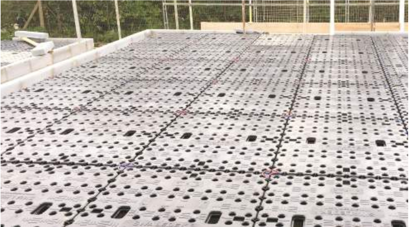
Swale deck safety decking / crash deck, 2m high x 1.2m 2 panels