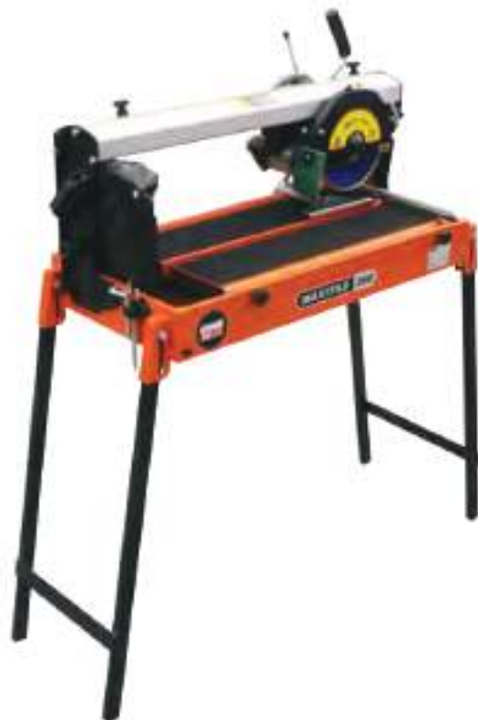
Tile cutting sliding table saw's