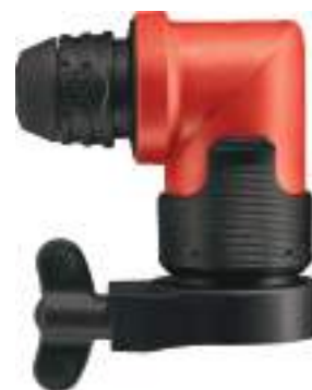
Hilti TE AC-2 Right angle chuck to suit Hilti TE7