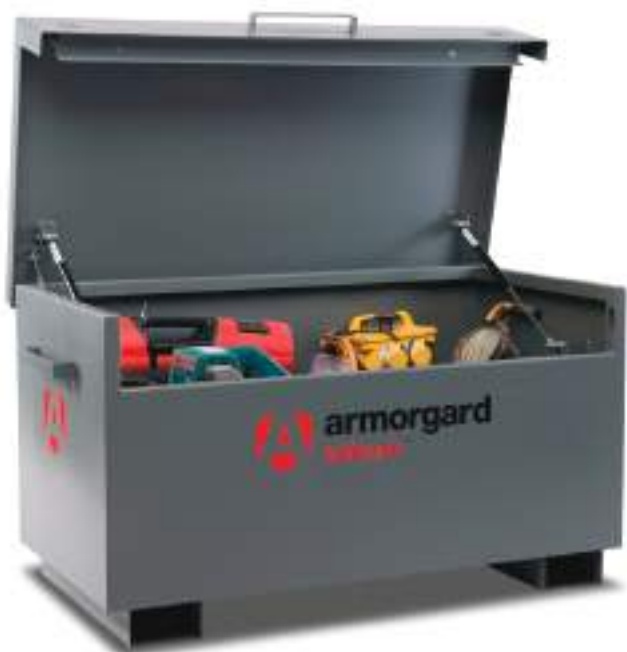
Site box - approx. 1.2m x 0.6m x 0.6m