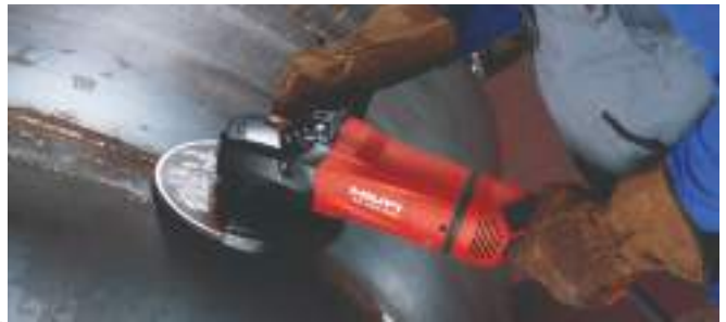
9" angle grinder, 110V