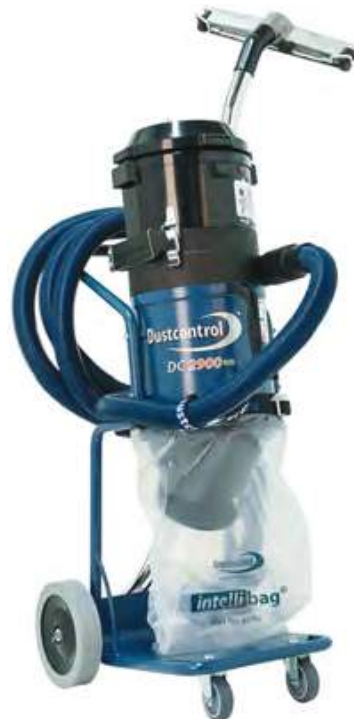
Dust extraction vacuum Dust collection bags sold separately