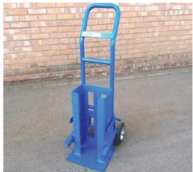
Test weight stillage Test weight trolley for use with stillages