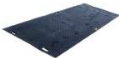
Trak Mats 8' x 4'