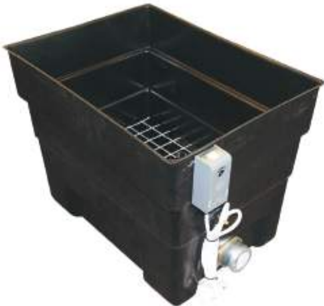
Concrete cube curing tank