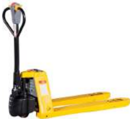
Electric pallet truck