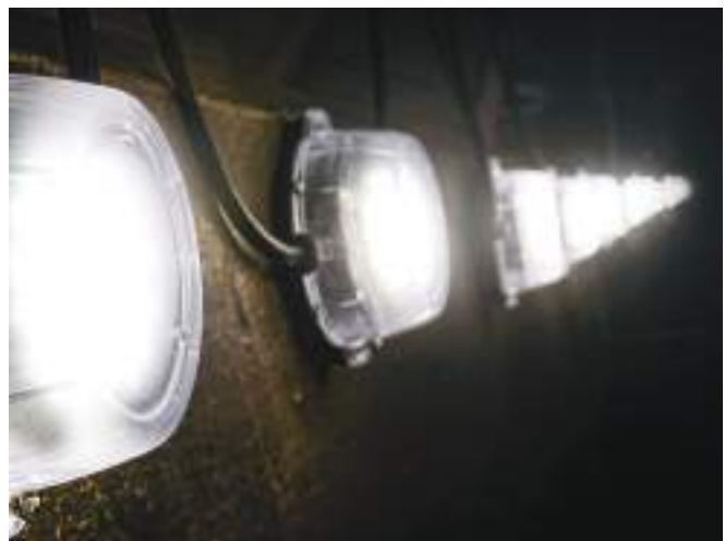
LED festoon lighting