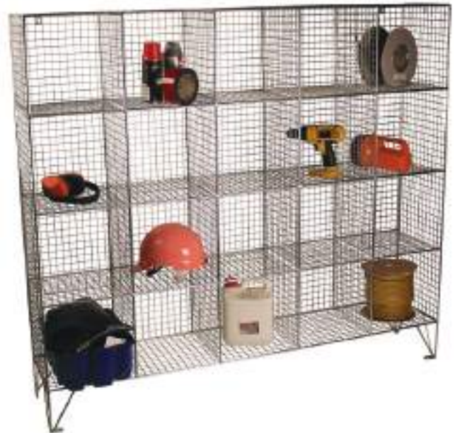
Mesh bank lockers, various sizes with 2 – 20 compartments