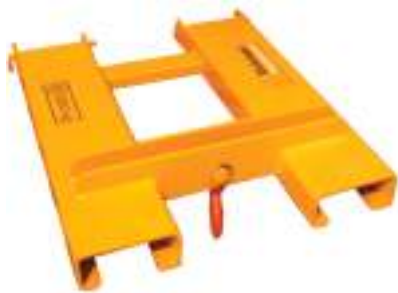
Forklift 3 tonne S.W.L. hook attachment