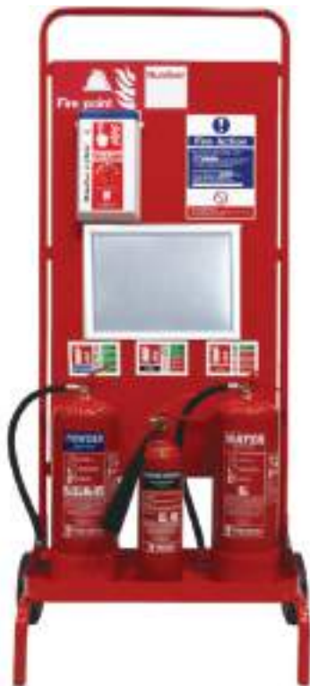
Fire point stands, c/w howler fire alarms and 2 fire extinguishers