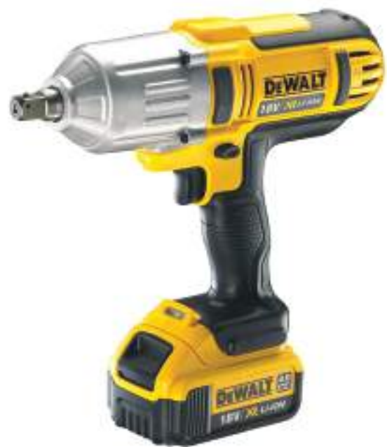
18V 1/2" cordless impact wrench