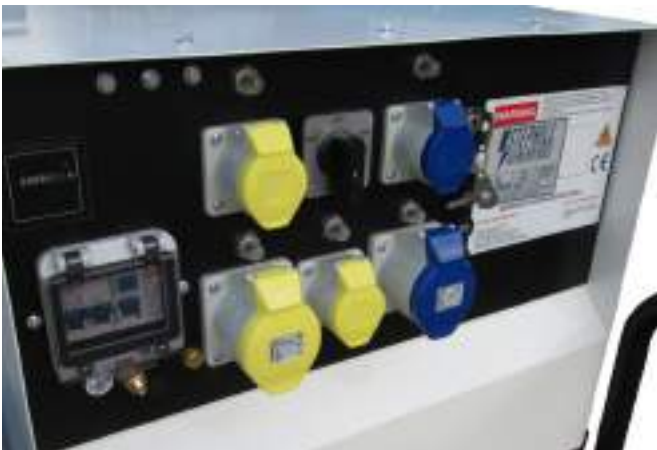
Super silenced diesel generator