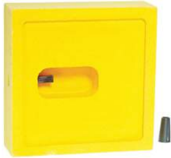
Protimeter Humidity box