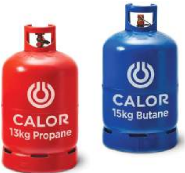
Propane / Butane gas, per bottle Gas bottle rental