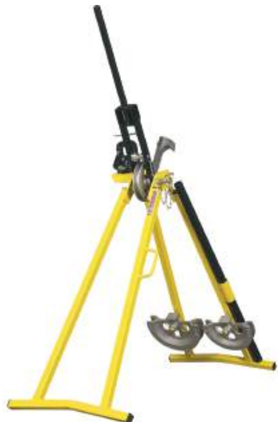
Stand mounted copper bender Other equipment available on request