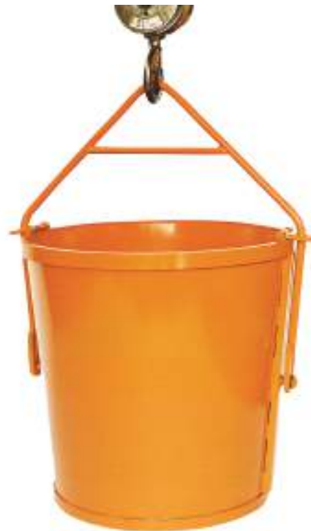
Roll Over Muck Skip / Bucket