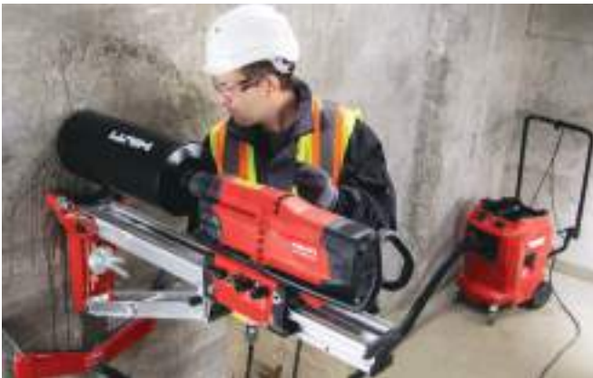
Hilti DD250 core drill and rig