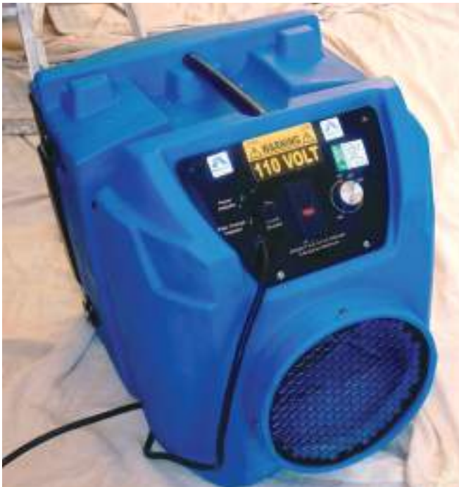
Predator air scrubbers. 5m x 250mm, lengths of ducting can be supplied