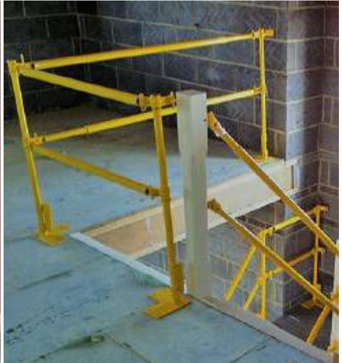
MKE Stairwell and edge protection guardrail system