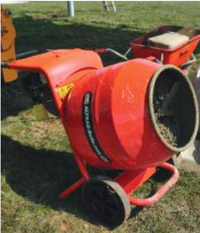
90 litre Belle 150 mixer, 110V