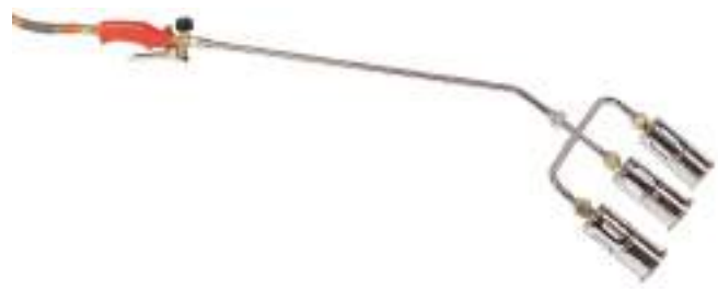
3 head blow torch and lance