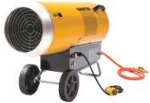
Space heaters - LPG / 110V