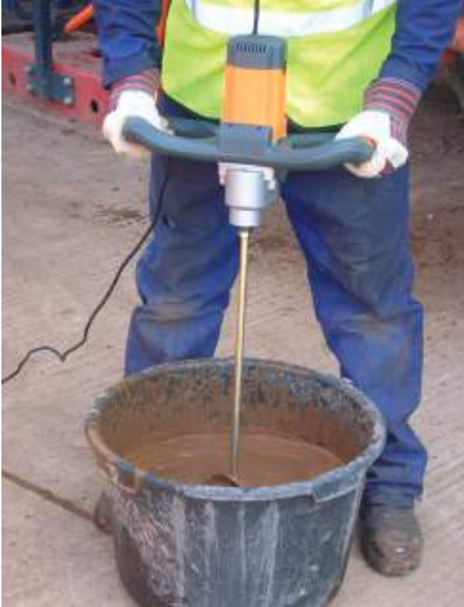
Paddle mixer / mixing Drill, 110V