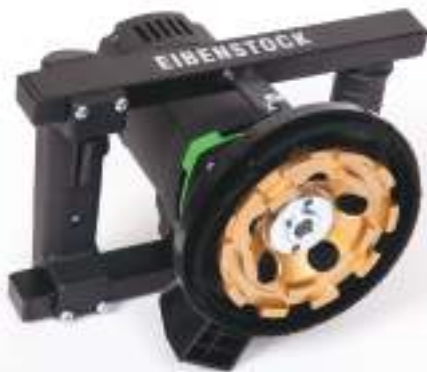
Handheld concrete grinding tool, 110V