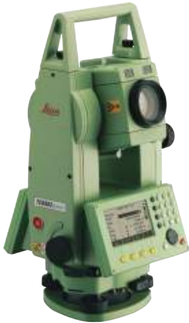
Leica total station