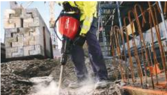
Hitli TE1000 heavy breaker