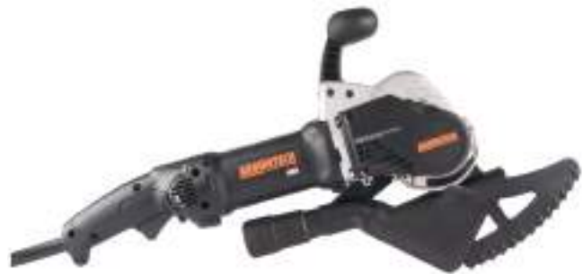
Masonry wall saw, 110V (Allsaw)