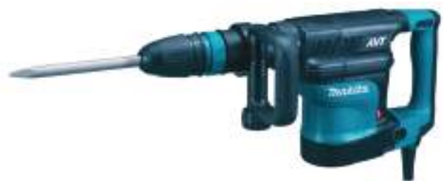
Makita HM1111C or similar medium breaker