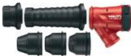
Hilti Dust extraction kit TE DRS -B For use with Dust extraction vacuums