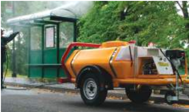
Towable diesel bowser washers