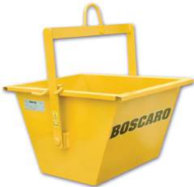
90 litre scaffold hoist bucket