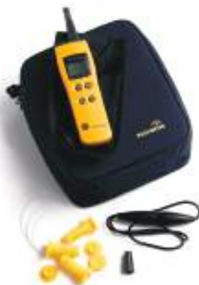
Protimeter Thermo Hygromaster