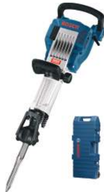
Bosch GSH161 16kg breaker or similar