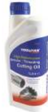
5L cutting oil