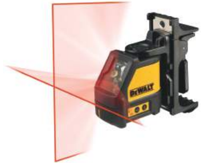
Dewalt laser level DW088K