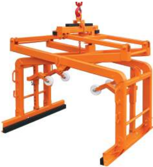
Full pallet block / brick grab