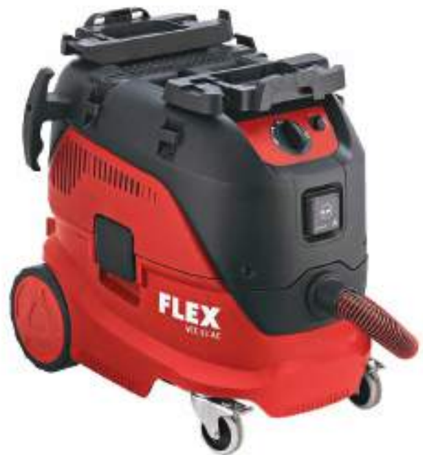
Dust extraction unit for sanders and power tools