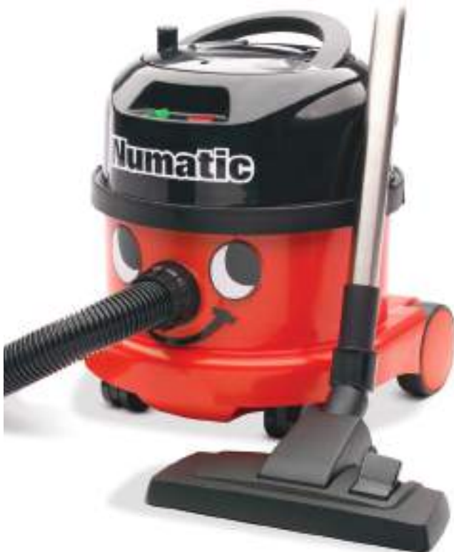
Numatic vacuum cleaner 110V or 240V