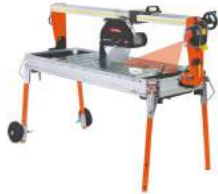
14" Rail Saw (x1500mm) – 110V