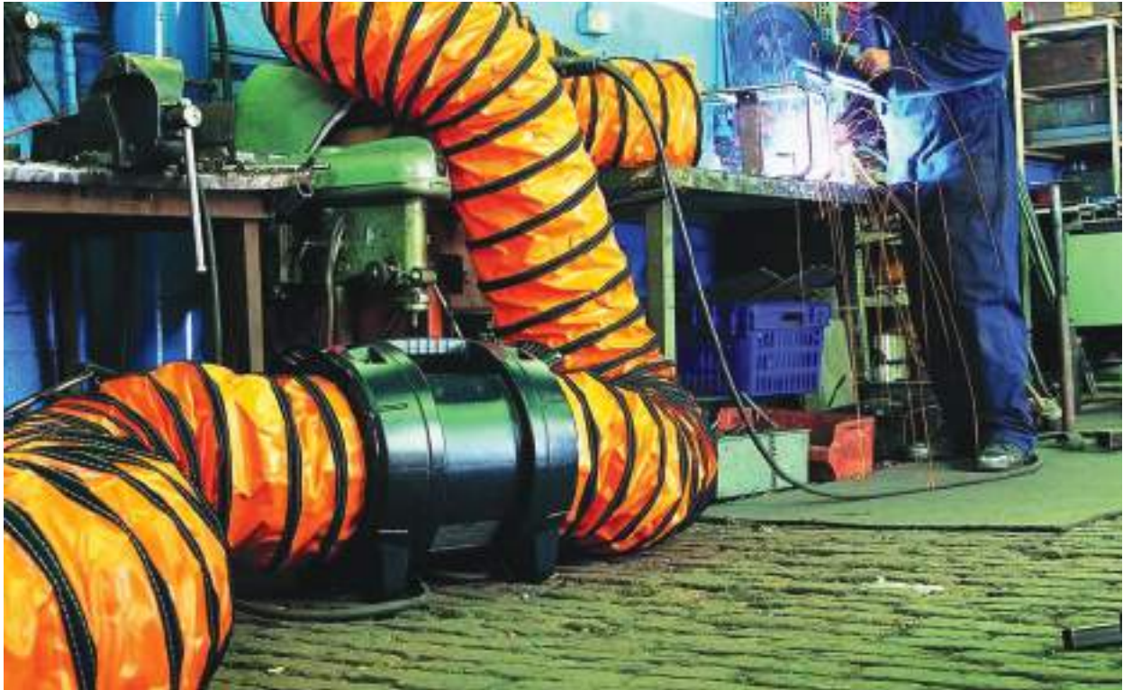
300mm fume extractors c/w 5m duct, 110V. Additional lengths of ducting can be supplied