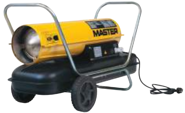
Space heaters - gas oil / 110V