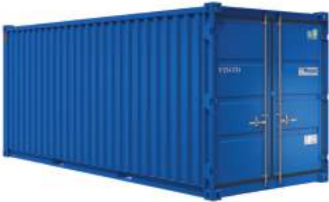
Shipping containers 20' or 10' x 8

CONTAINERS CAN BE SUPPLIED WITH A VARIETY OF RACKING AND SHELVING SYSTEMS, AS WELL AS PURPOSE MADE LOCK BOX PADLOCKS