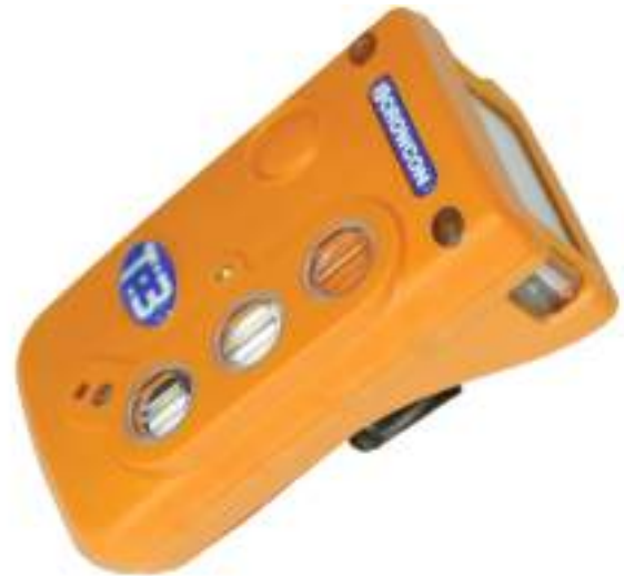
Tetra:3 gas detector. Other models available