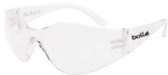
Safety glasses standard