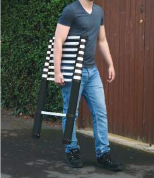
3.8m Telescopic surveyor ladder