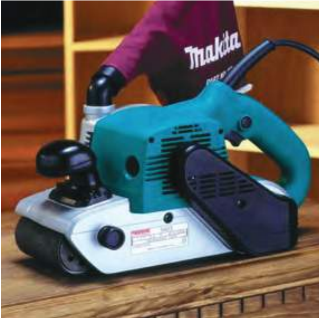
Belt sander, 110V