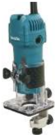
Laminate trimmer (mini router), 110V