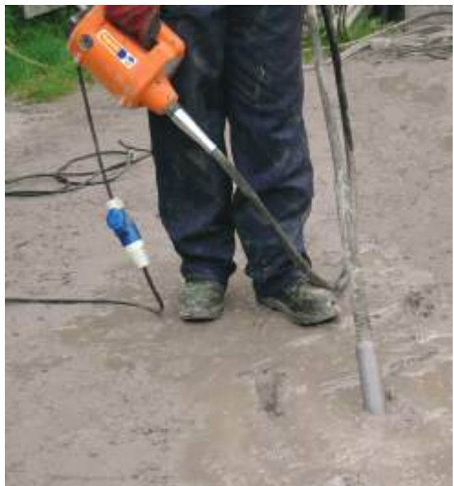
Belle MegaVib+ 110V 1.6kW Portable Electric Vibrating Mechanical Poker Drive Unit with 3m Flexible Shaft. Various head sizes available, 25mm - 48mm