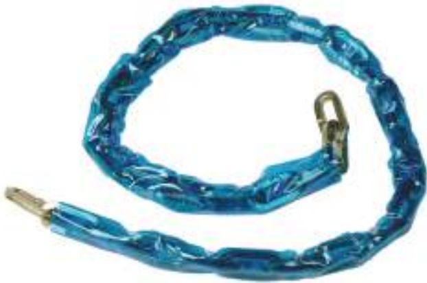
1m security chain