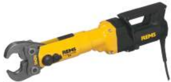
15mm - 54mm Crimping machine