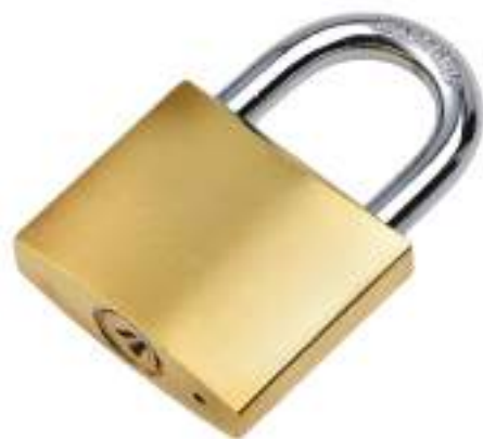
Padlock industrial standard HD duty