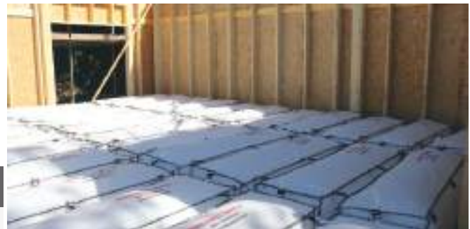
2.5m fall arrest soft landing bags