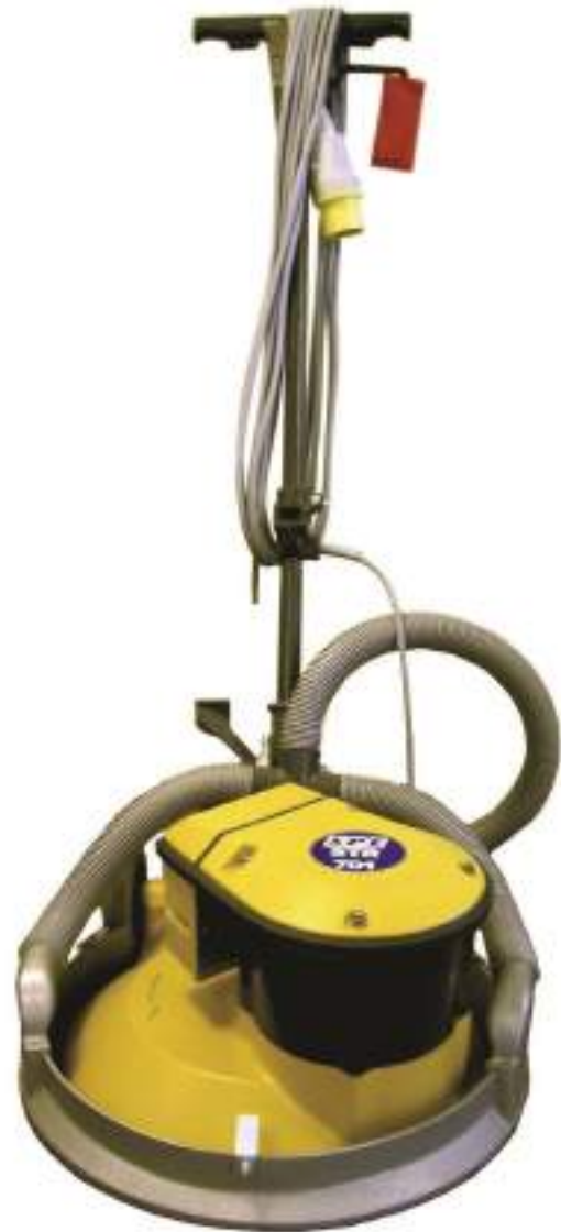
Floor scarifier STR701 110V, can be supplied with dust extraction skirt with hoses