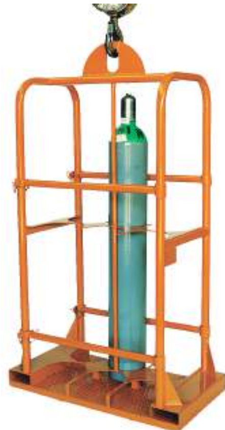
Gas bottle carrier cage, 4 bottle