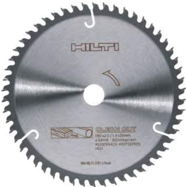
190mm - 230mm circular saw blades