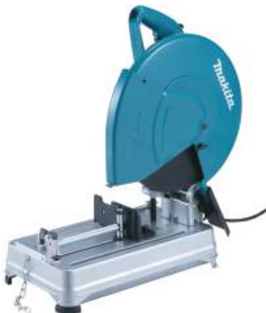
Bench top metal chop saw, 110V