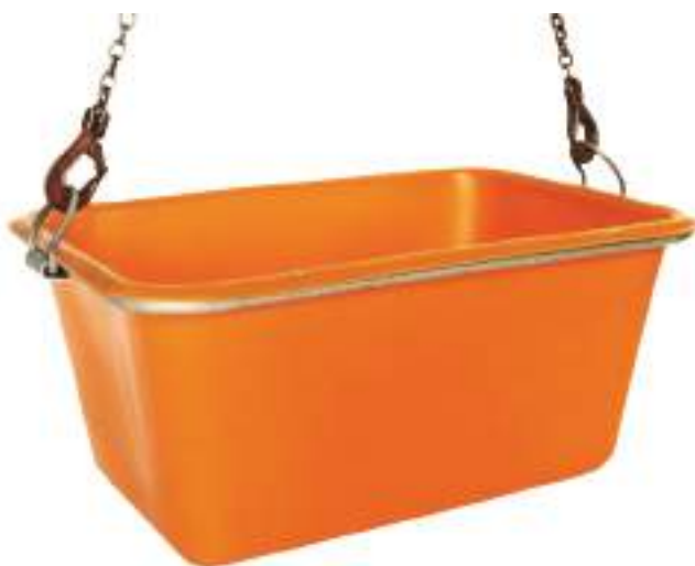
Crane lift mortar tubs