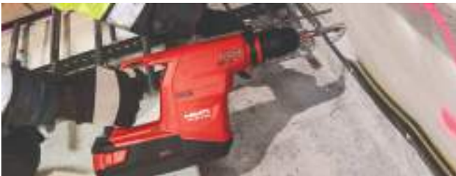
36V Heavy duty hammer drill (with extra battery)