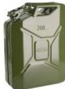
20 litre jerry can 5 litre plastic fuel can