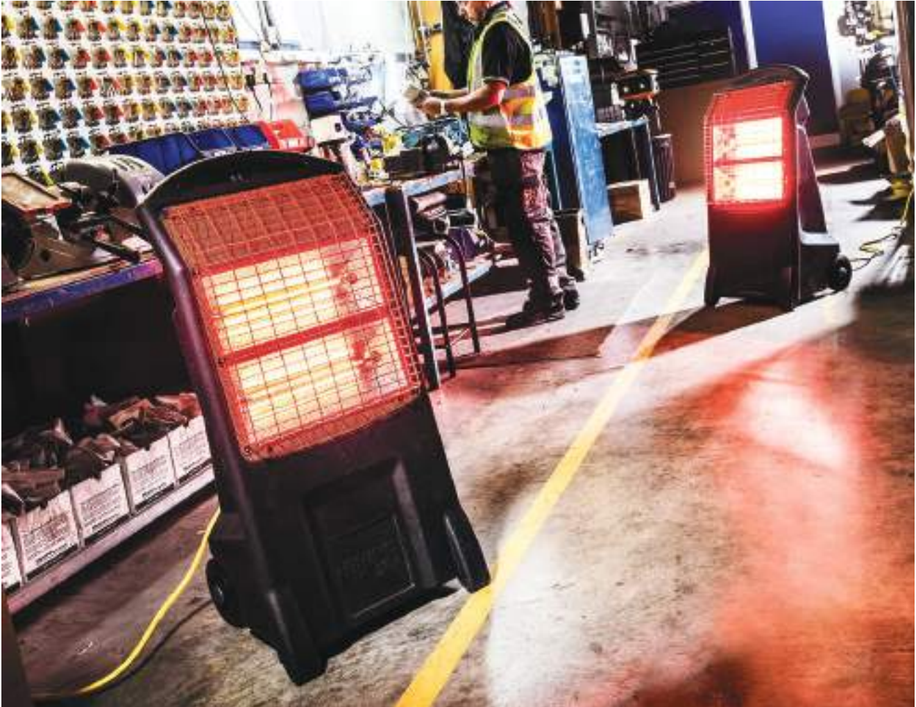
TQ3 Infra red heater (Red rad heater) 110V