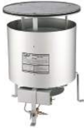
Bin Heater LPG