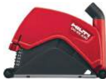
Hilti grinder dust extraction hood