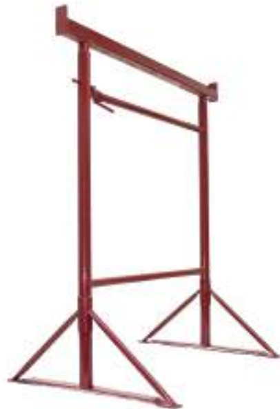
Trestles Size 1 : 0.48 - 0.84m Size 2 : 0.78 - 1.37m Size 3 : 1.06 - 1.83m