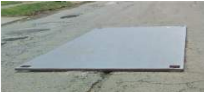
4' x 4' steel road plates 8' x 4' steel road plates