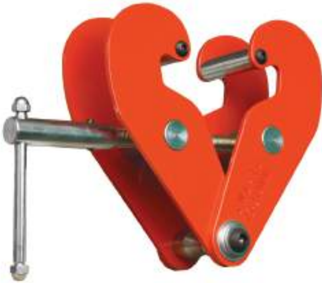
Beam clamps - various safe working loads