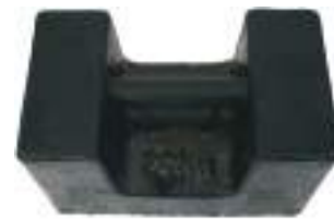
Hand test weights - 25kg