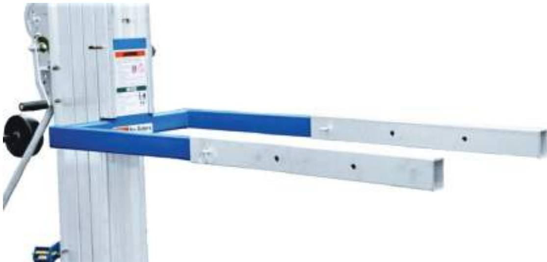
Fork extensions - material lift