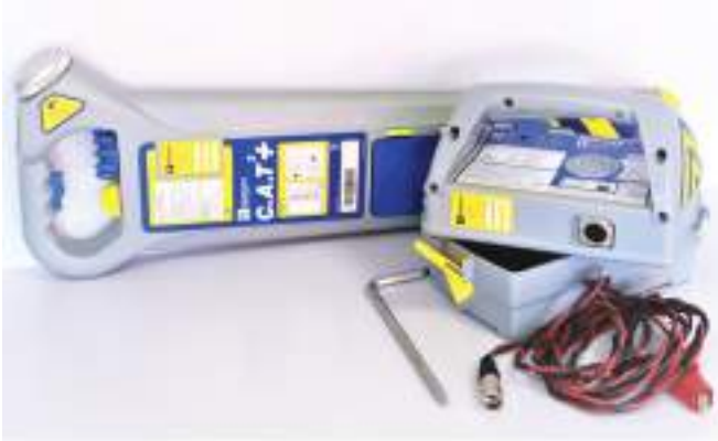
Radiodetection CAT Radiodetection Genny