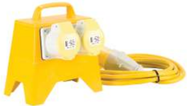
110V, 32 amp 2 way splitter boxes