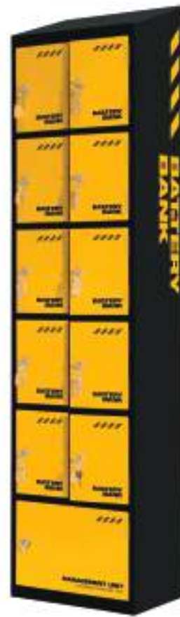
Battery bank lockers, 240V