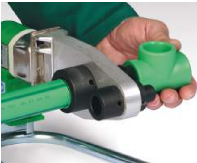
110V 800W or 1400W Aquatherm pipe jointing tool