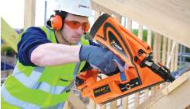
Cordless first fix framing nailer, Paslode IM360 or similar