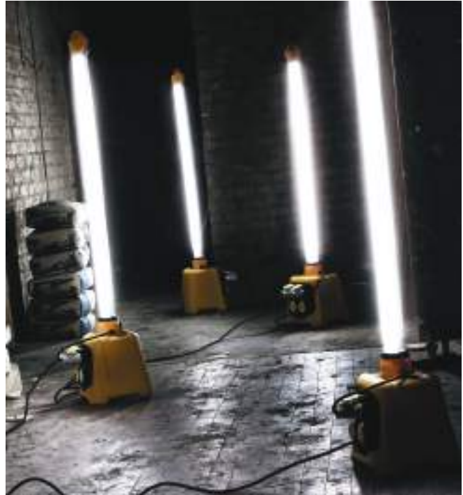
Upright LED Worklight