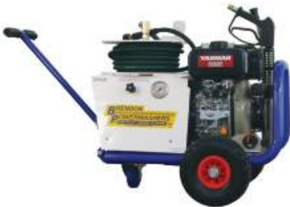
Diesel cold water pressure washer