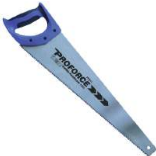
22" Hardpoint handsaw