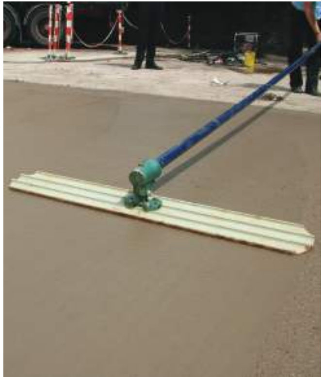
Big Blue Float, manual concrete float