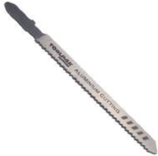
105mm jigsaw blades wood 100mm jigsaw blades mild steel