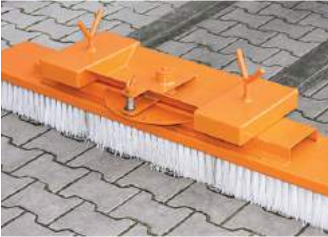
Forklift 2000mm ground sweeper brush attachment