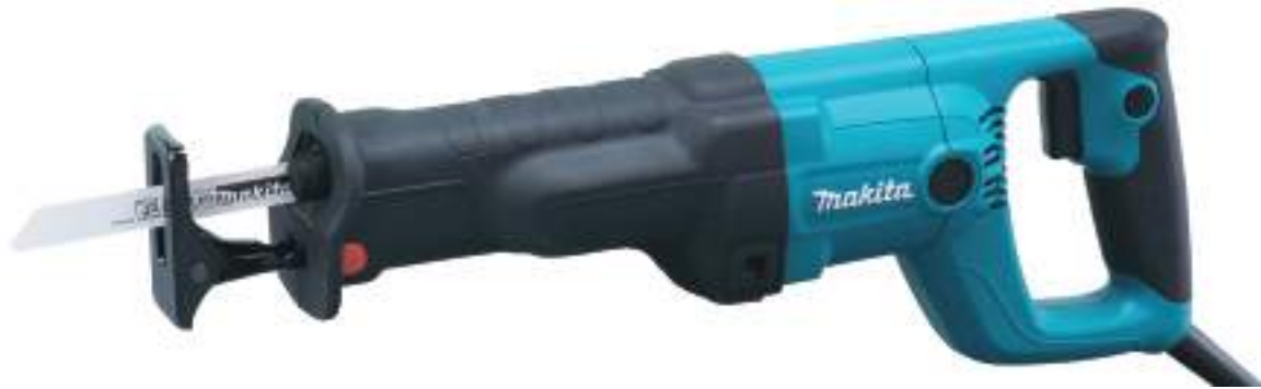
Reciprocating saw, 110V or cordless