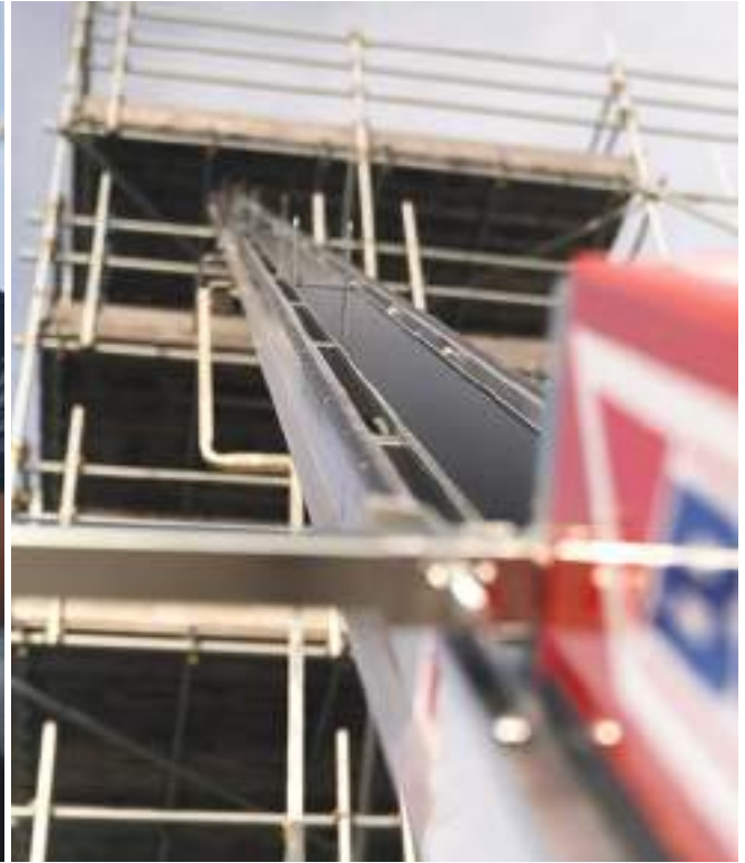
Bumpa Hoists, 8m to 10m