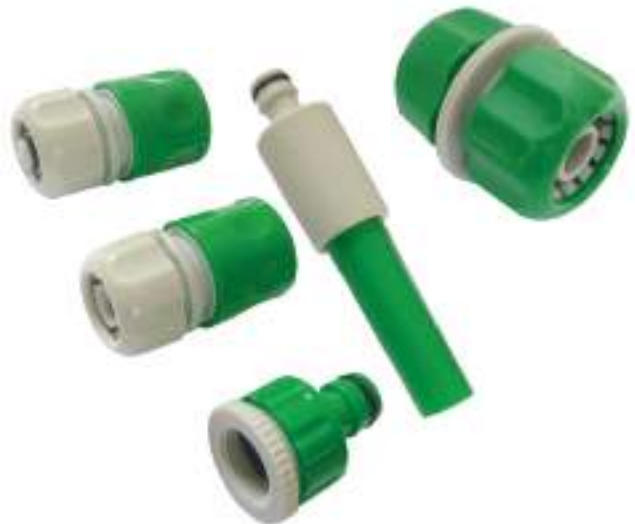
1/2" hose connectors and fittings