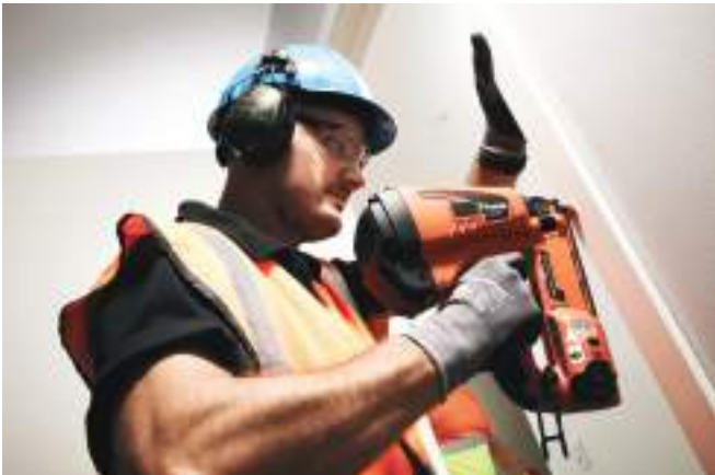
Cordless second fix brad nailer, Paslode IM65 or similar Gas fuel cells and nails