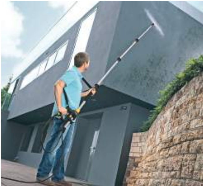
Pressure washer 10m telescopic lance with brush head Pressure washer telescopic lance