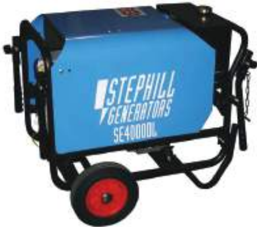
2.5 kVA mobile petrol generator 4KVA mobile silenced diesel generator