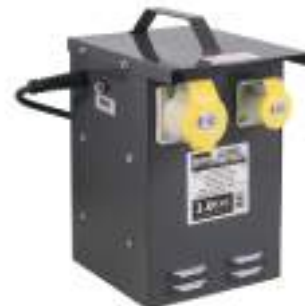
Vented continuous power transformer for heaters