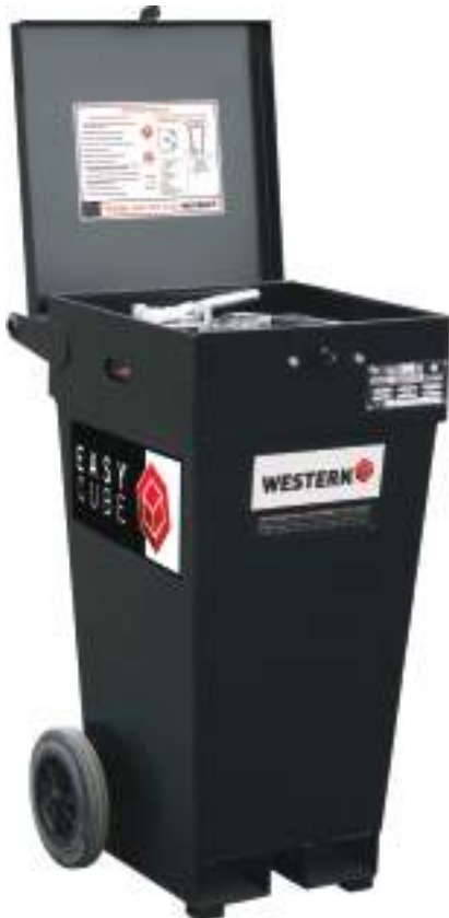
105 Litre Easycube wheeled bunded fuel dispenser / fuel caddy