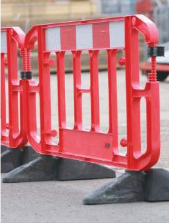
2m Titan barriers, red & white plastic barriers