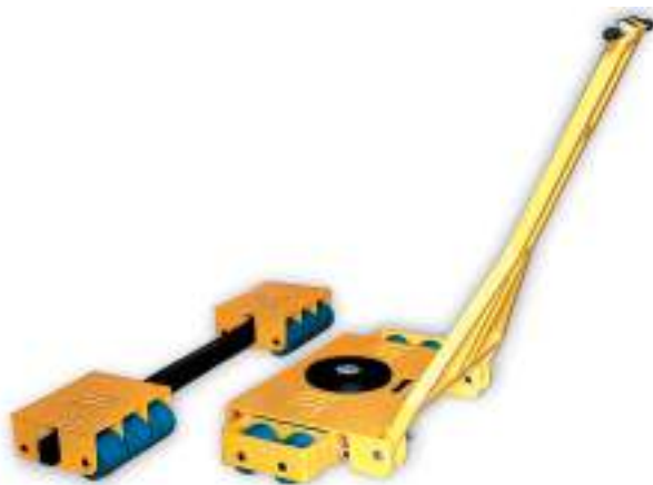
Nylon skates, S.W.L. 10 tonnes, set of 3