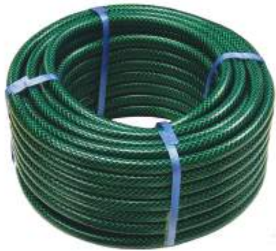
Garden hose or reinforced heavy duty hose in various lengths