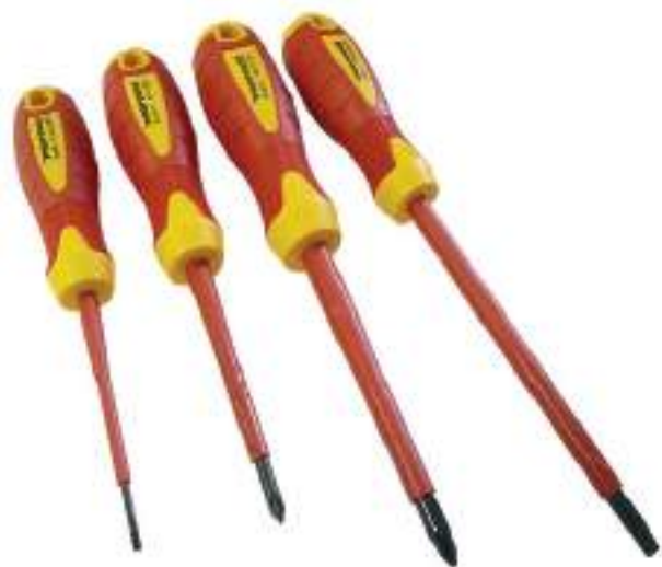
Screwdriver mixed set