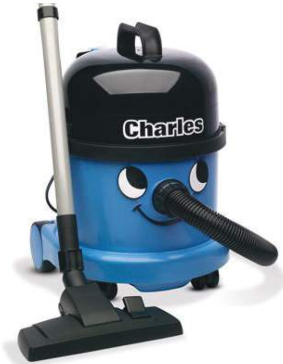
Charles wet & dry vacuum cleaner, 110V