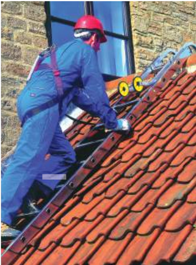
Class 1 industrial triple extension ladders approx. Closed and open lengths shown.