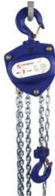
Manual chain blocks, various height and safe working loads