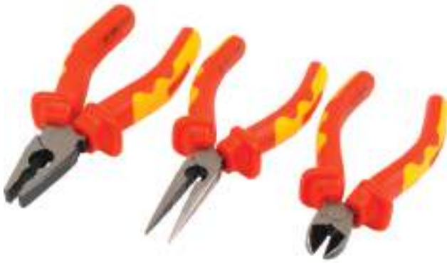
Plier mixed set