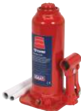
10 tonne hydraulic bottle jack