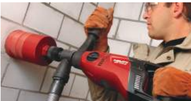
Hilti DD110-D hand held dry core drill or similar