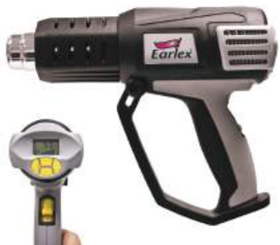
Hot Air Gun, 110V or 240V