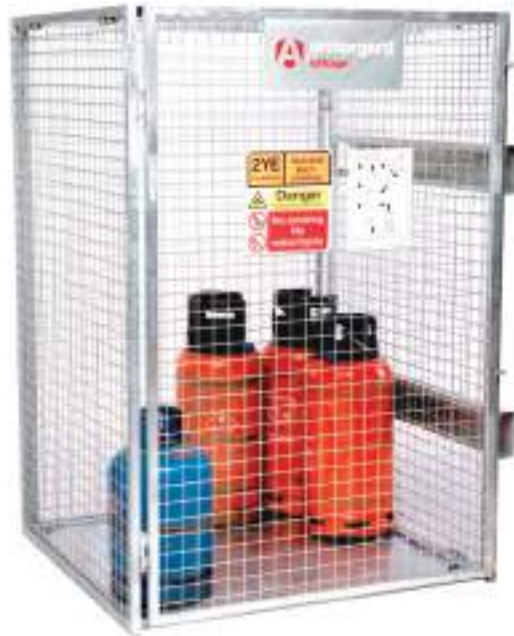
1.2m x 1.2m x 1.2m gas cage 1.8m x 0.9m x 0.9m gas cage 1.8m x 1.2m x 1.2m gas cage