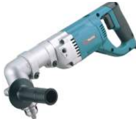
Right angle drill, 3 jaw chuck, 110V