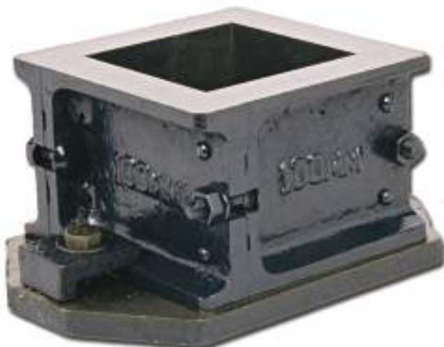
Concrete test cube moulds, 100mm or 150mm