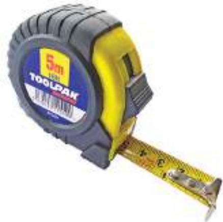
Tape measures 5m to 10m