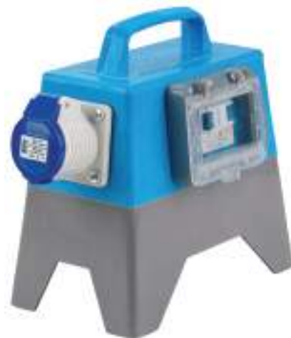
230V RCD units