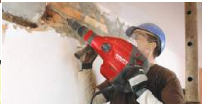
Hilti TE700 medium breaker