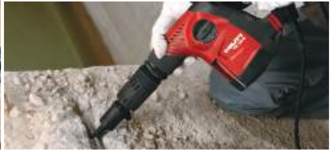
Hilti TE300 light breaker Needle gun attachment TE106