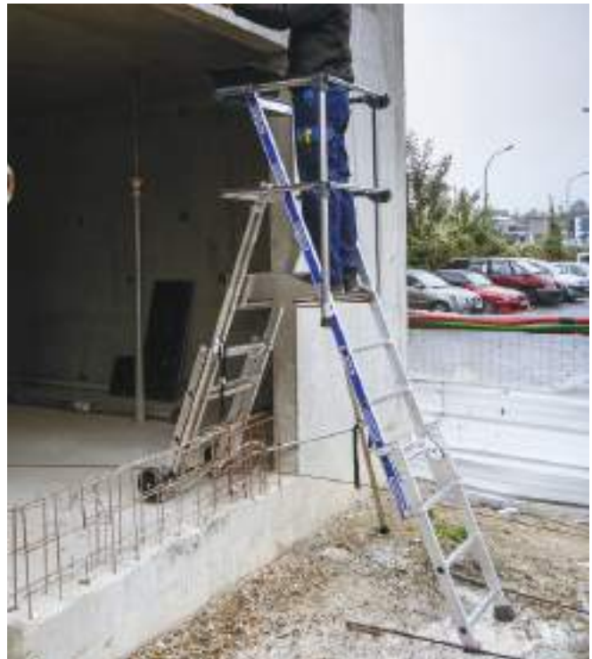
Sherpascopic Telescopic Platform