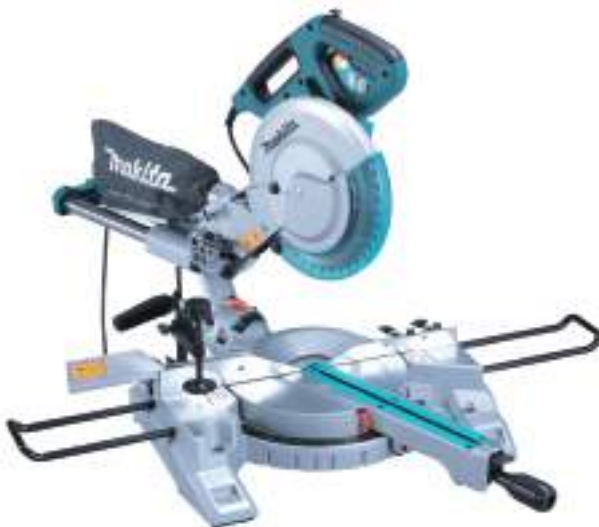
Slide mitre saw, 110V