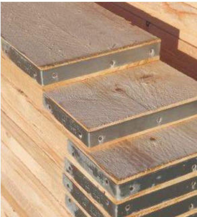
Timber Scaffold Boards 6' to 13'

Langton's trestle handrail system comprising posts, end gates, end barriers, ladder brackets, pole ladders, stabilisers and scaffold boards for guardrails and toe boards. This can also be supplied as a complete trestle working system also including all necessary trestles and scaffold boards for the working platform