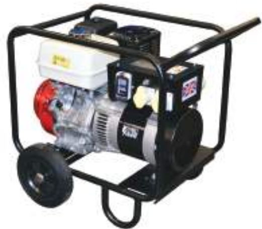
200A mobile petrol welder generator Optional extras include: Set of welding leads, Earth clamp with cable Welding Gauntlets (sale only) and Auto adjust welding mask