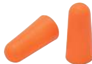
Single use foam earplugs