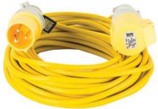
14m 110V leads – 16 amp or 32 amp