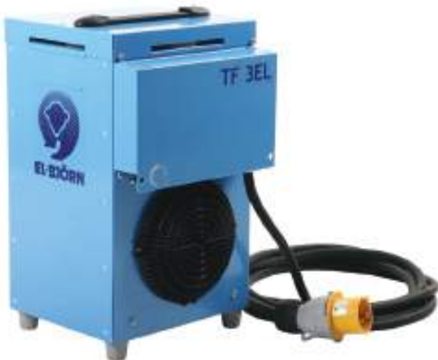
El Bjorn heaters