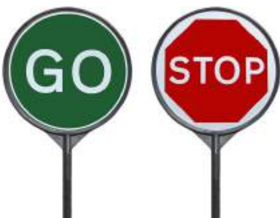
Stop / Go manual traffic management lollipop sign