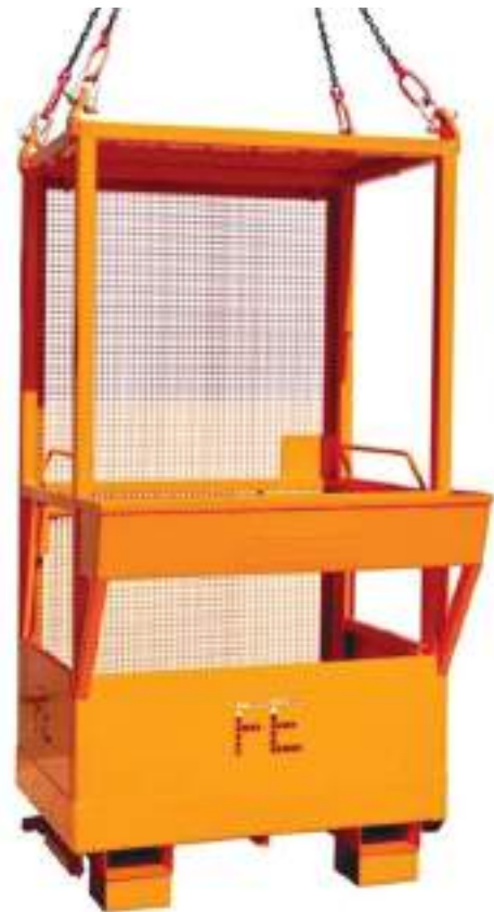
Crane lift access cage