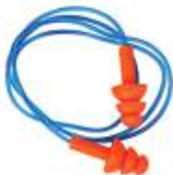
Corded ear plug pair