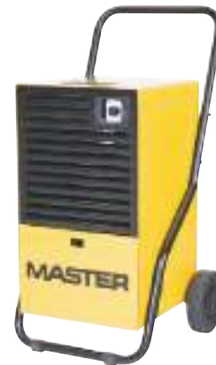
Dehumidifier (compact) Small units also available