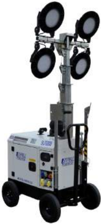
SLT5000 super silent lighting tower