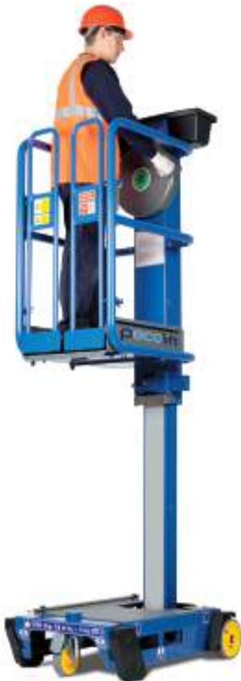
Pecolift manual work platform - 1.5m