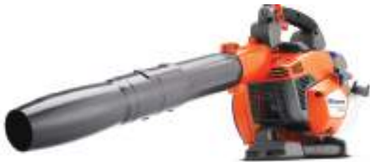
2 stroke petrol leaf blower