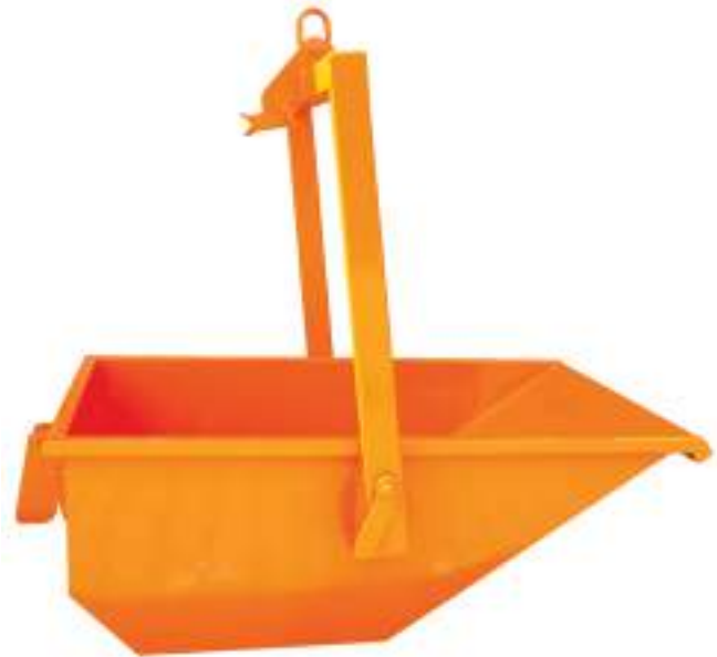
Self Discharging Boat Skips