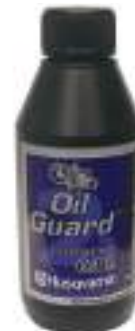
100ml Husqvarna two stroke oil