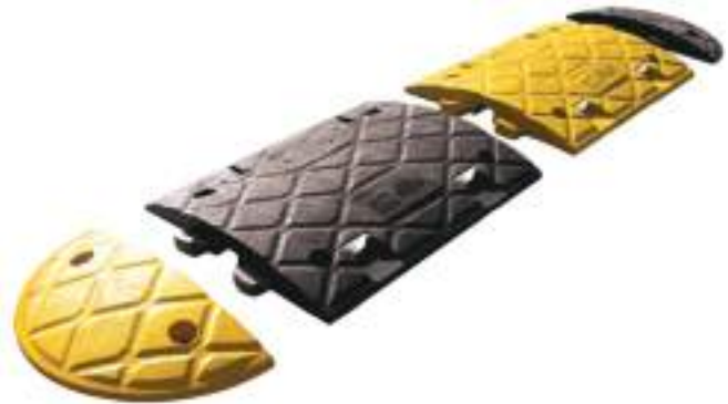
Speed control ramps, bolt down. Speed control ramp D end