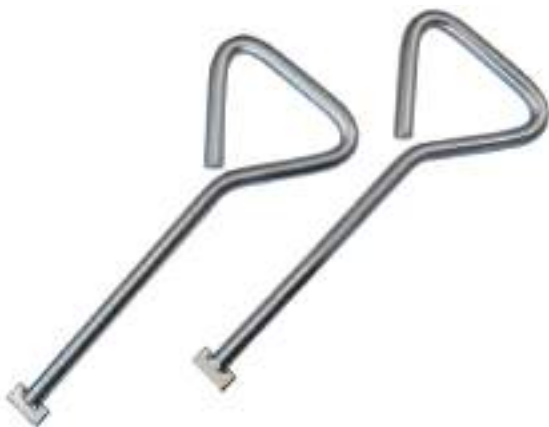
7" manhole keys pair