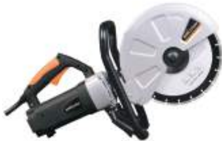
12" disc cutter, 110V