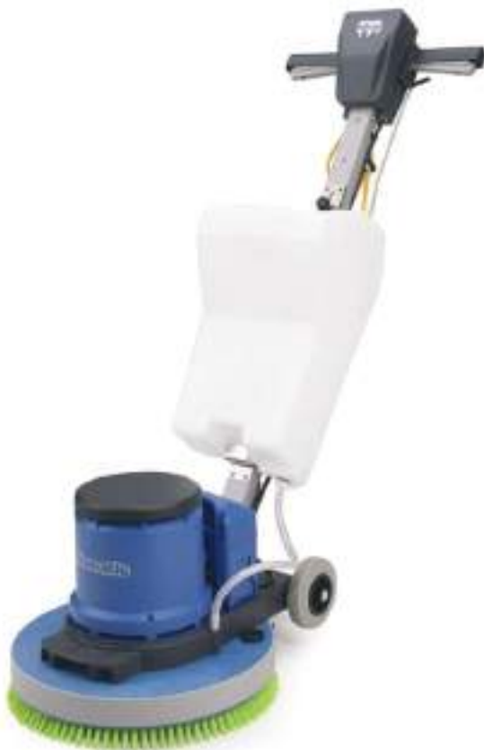
Numatic floor scrubber / polisher, 110V

WE CAN PROVIDE A WIDE RANGE OF DISCS, BRUSHES & ACCESSORIES FOR THESE MACHINES/ PLEASE CALL FOR DETAILS