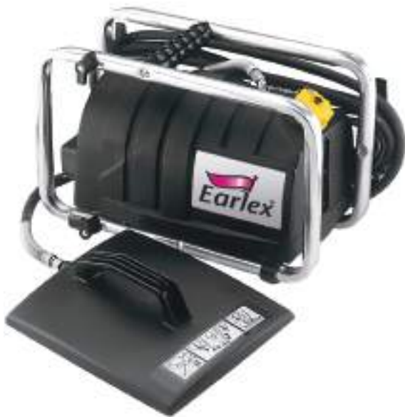
Industrial wallpaper steamer